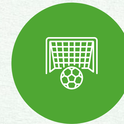
Mini football court