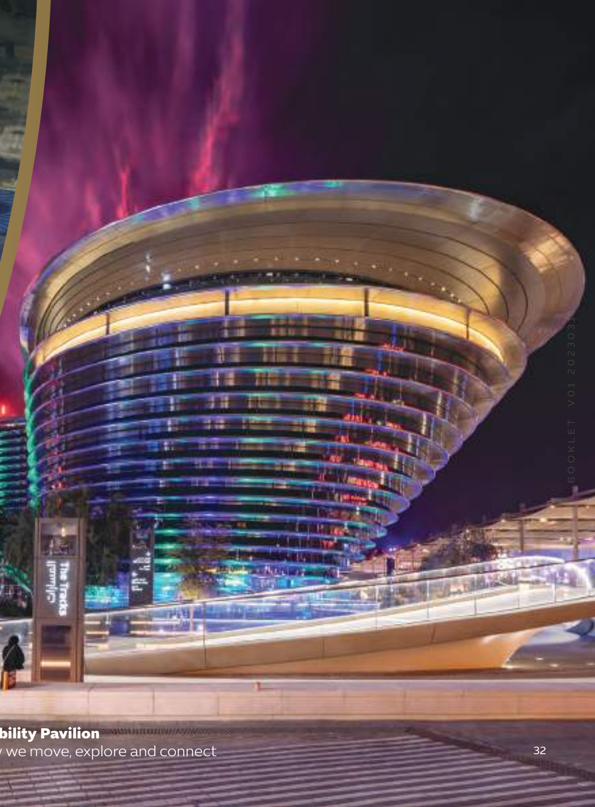
Alif – The Mobility Pavilion Exploring how we move, explore and connect