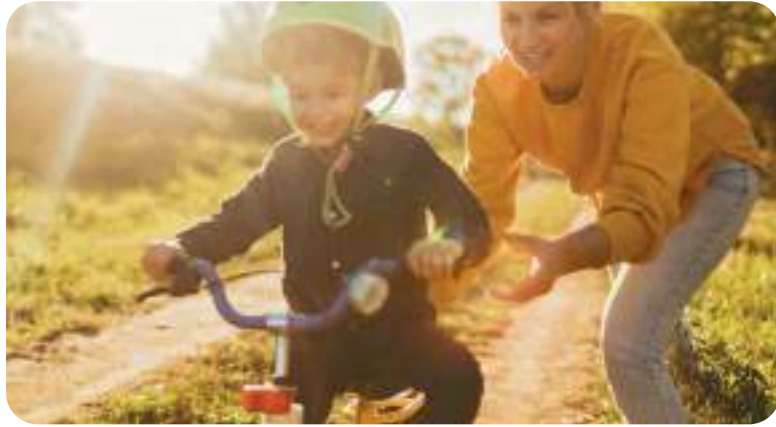
4.5 km of pedestrian tracks and 5.2 km of cycling trails