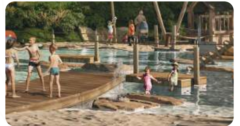
Swimming pools, splash pads and kids' play areas