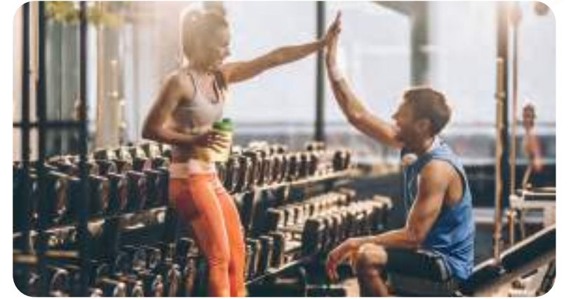
Gyms, outdoor wellness and fitness areas