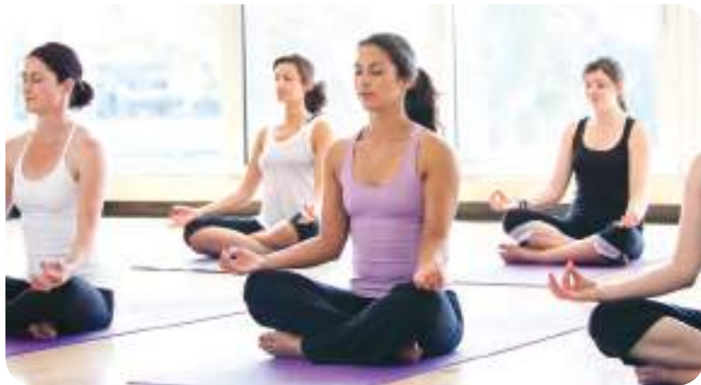
Yoga studio, health & beauty salon, spa, sauna