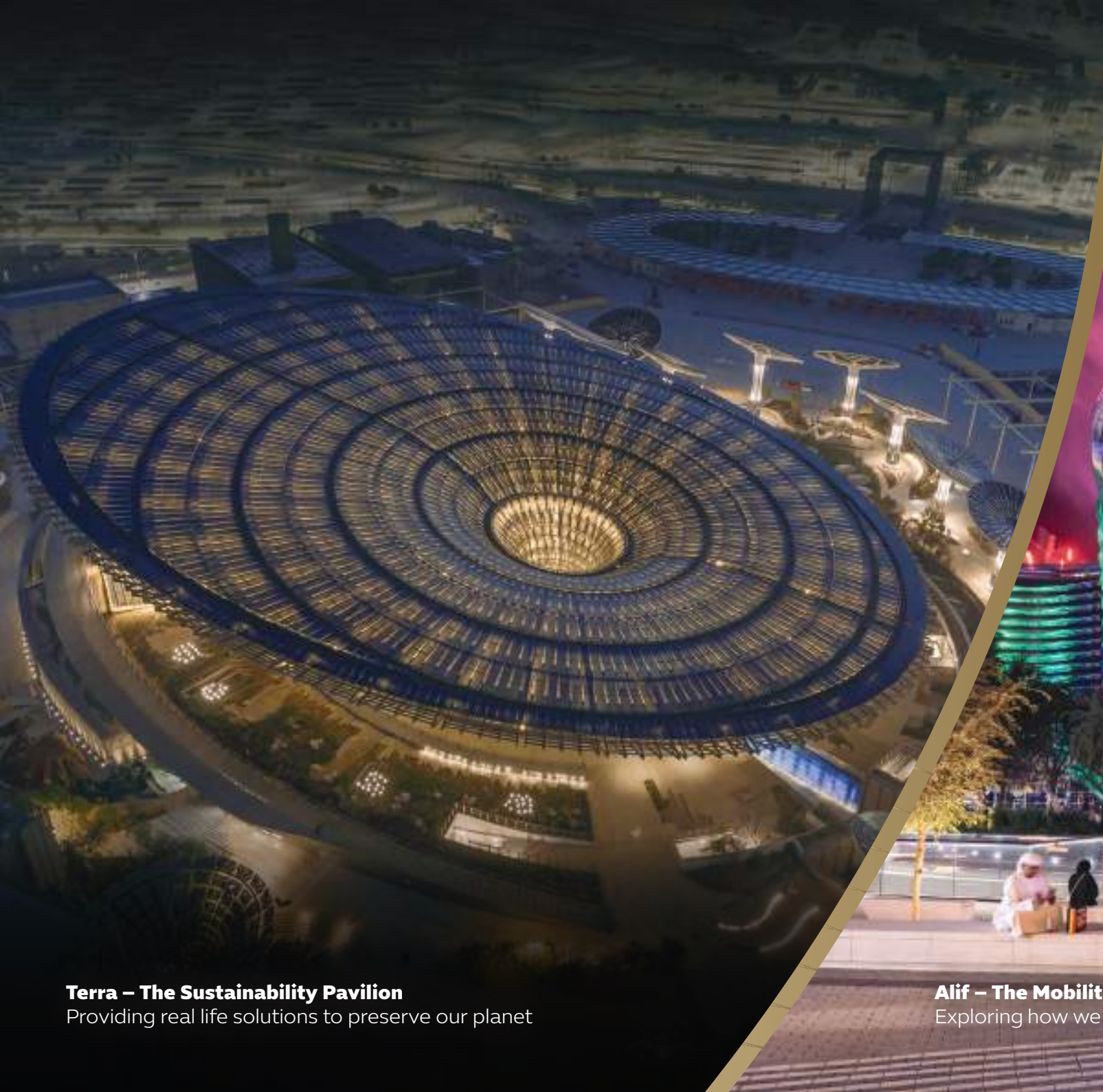
Terra – The Sustainability Pavilion Providing real life solutions to preserve our planet