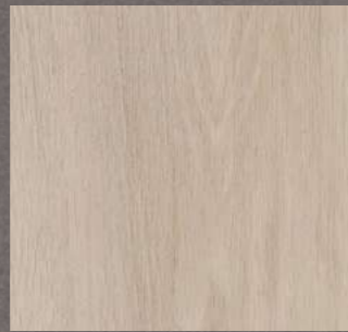
Tan Oak Wood