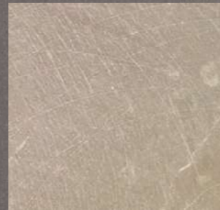
Fior Di Basco