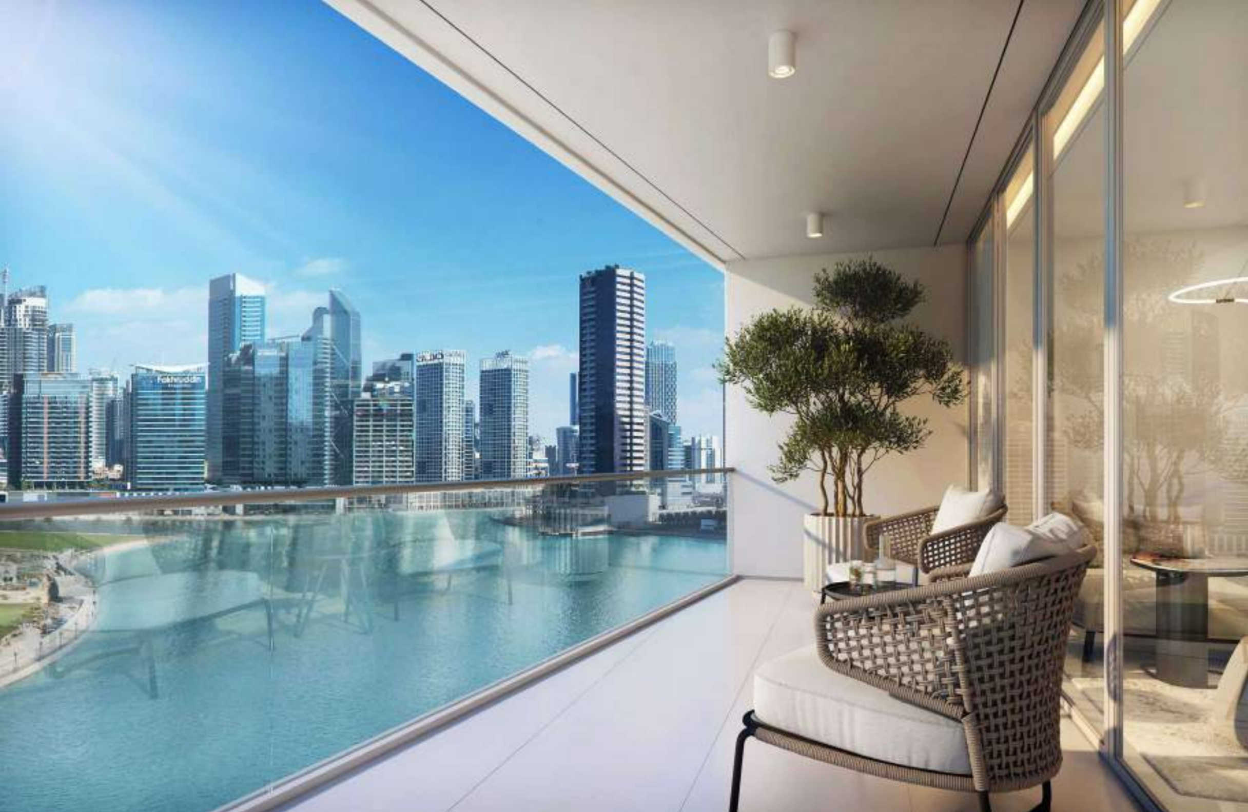
NORTH-EAST DAY VIEW