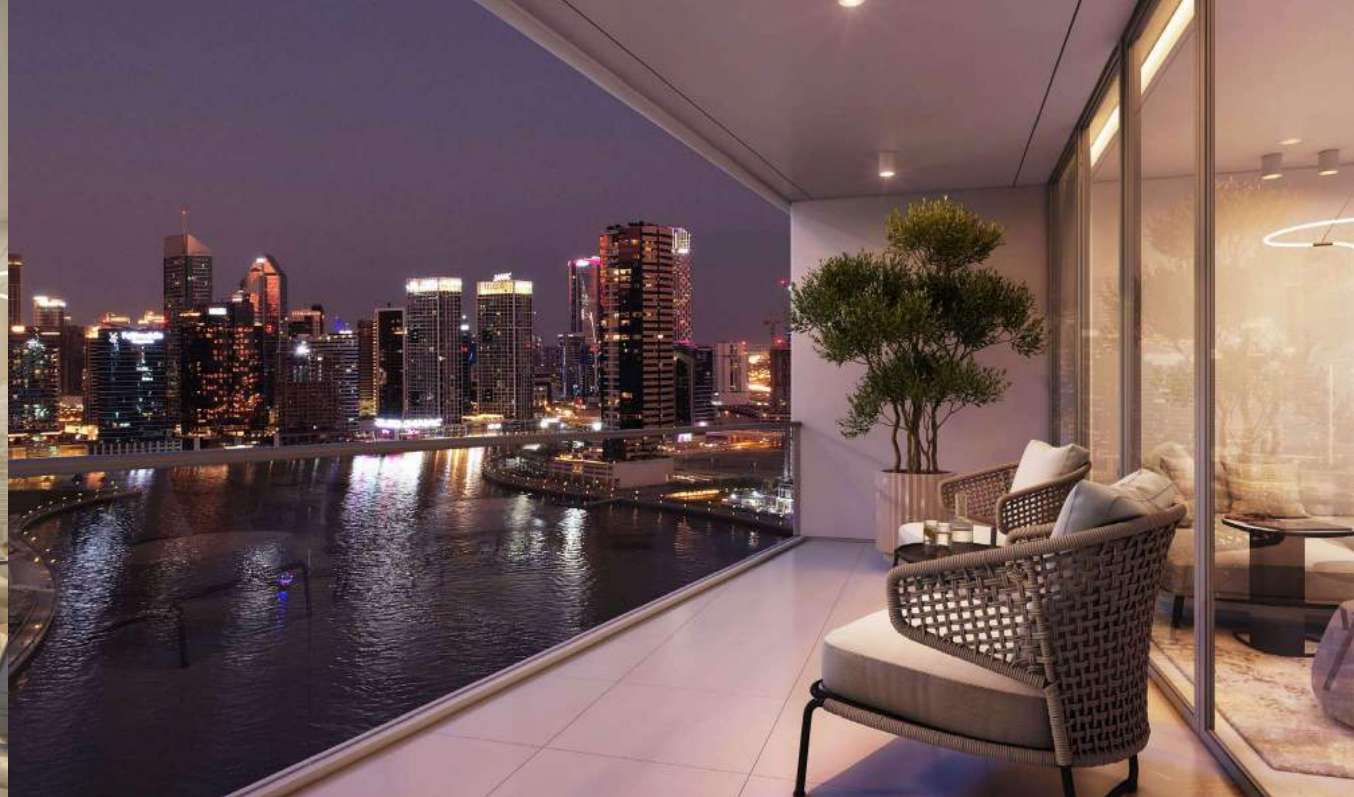
NORTH-EAST NIGHT VIEW