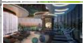
5. FITNESS CENTRE