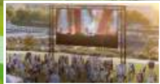
2. OUTDOOR CINEMA