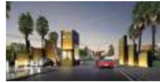
1. COMMUNITY GATE