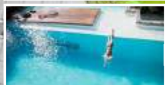
4. SWIMMING POOL