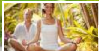
3. WELLNESS AREA