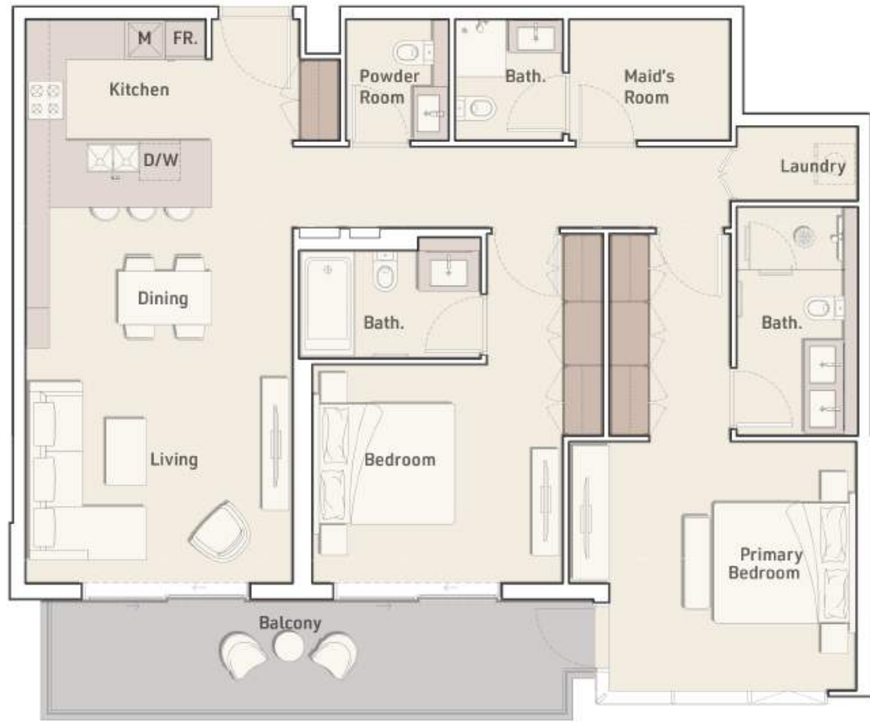
2 B E D R O O M + M A I D S