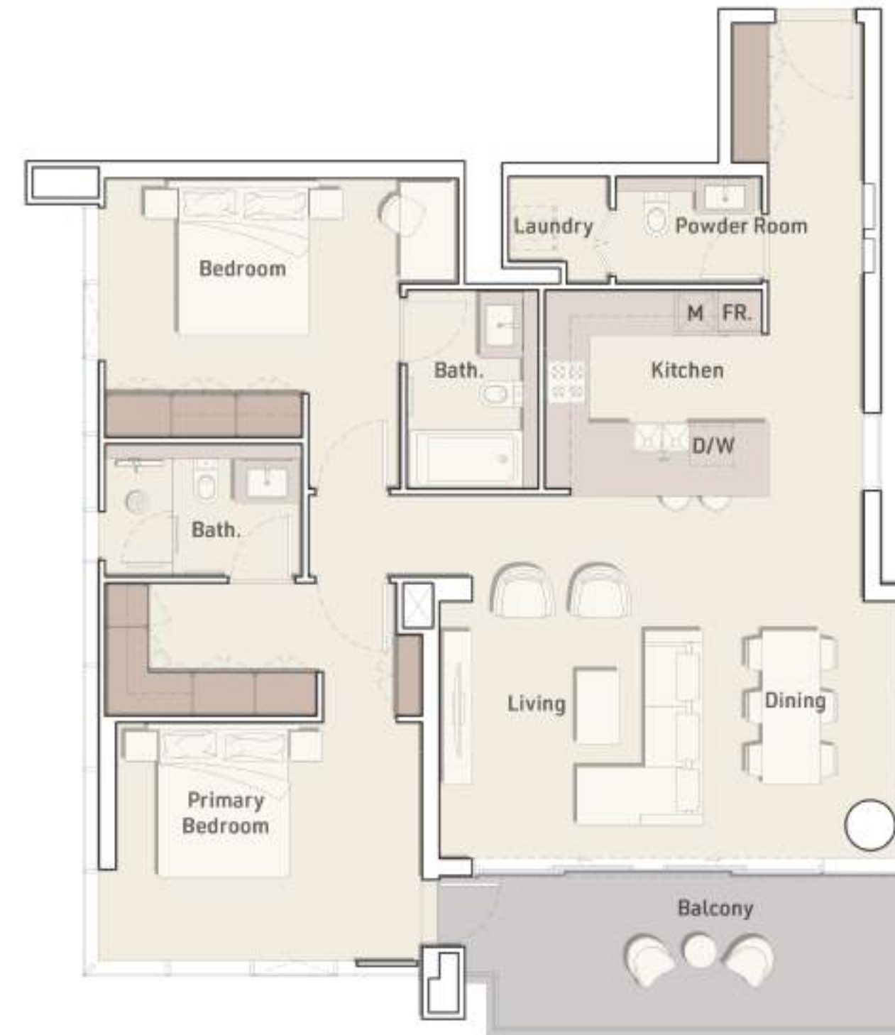
2 B E D R O O M