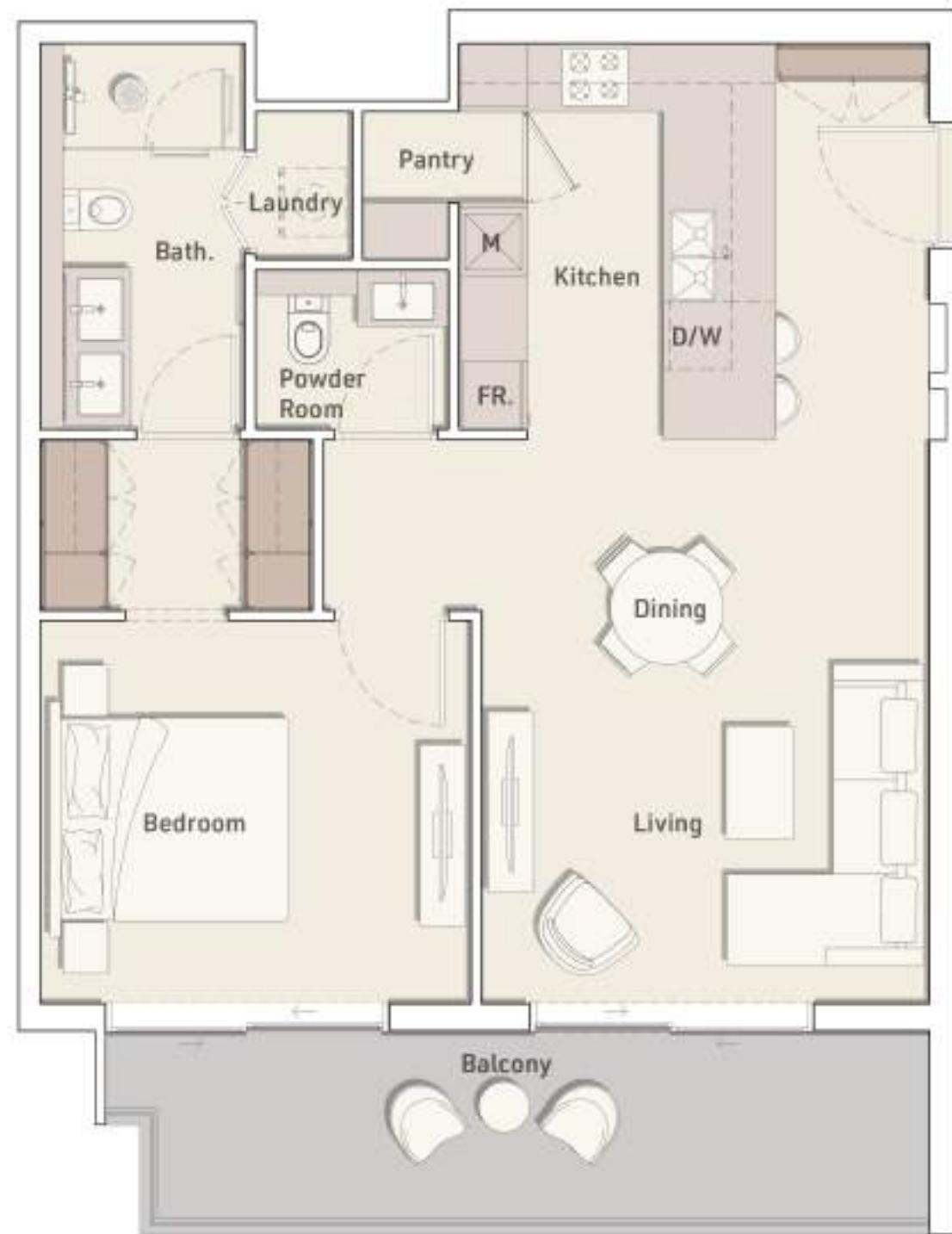
1 B E D R O O M