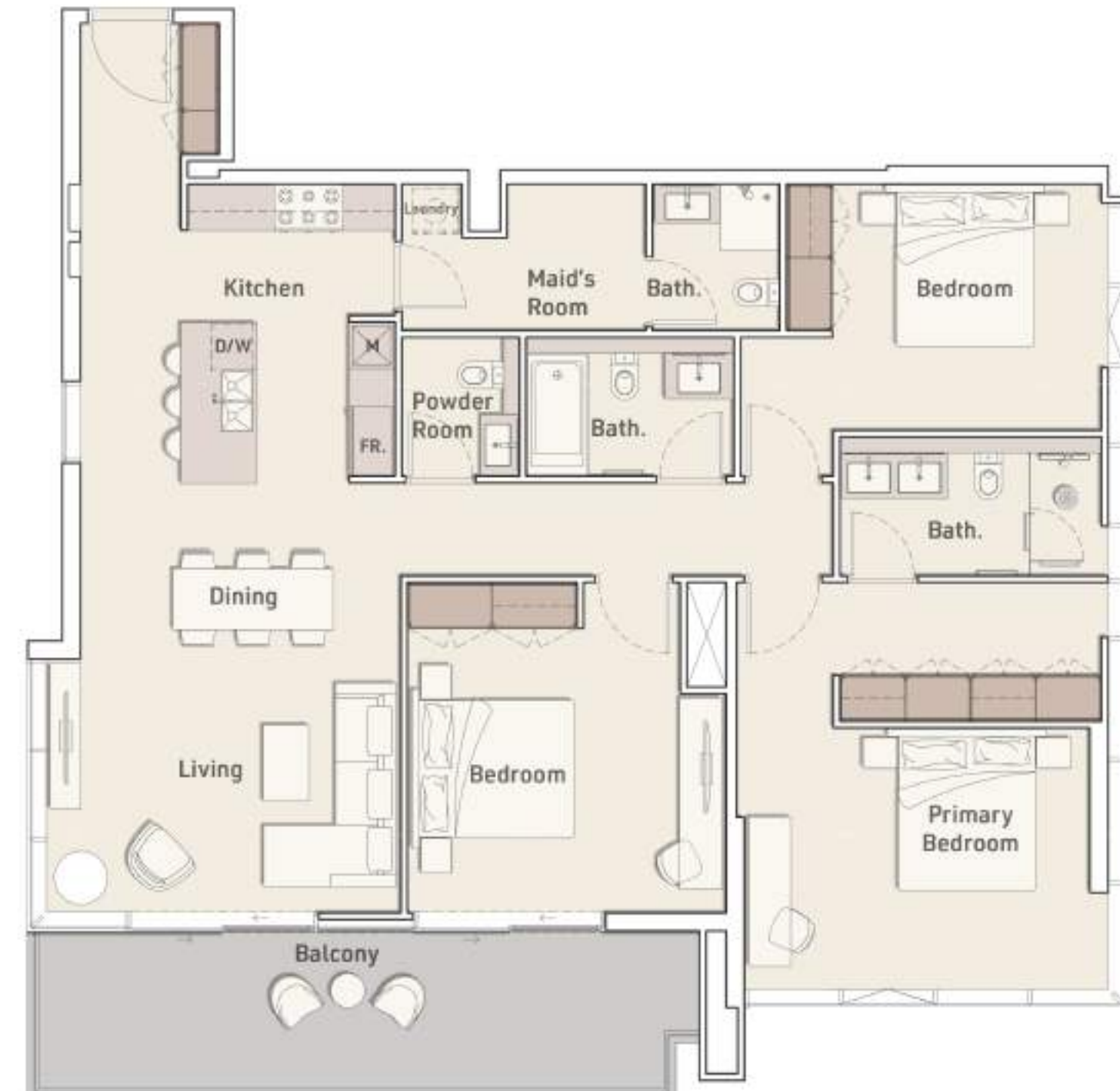
3 B E D R O O M