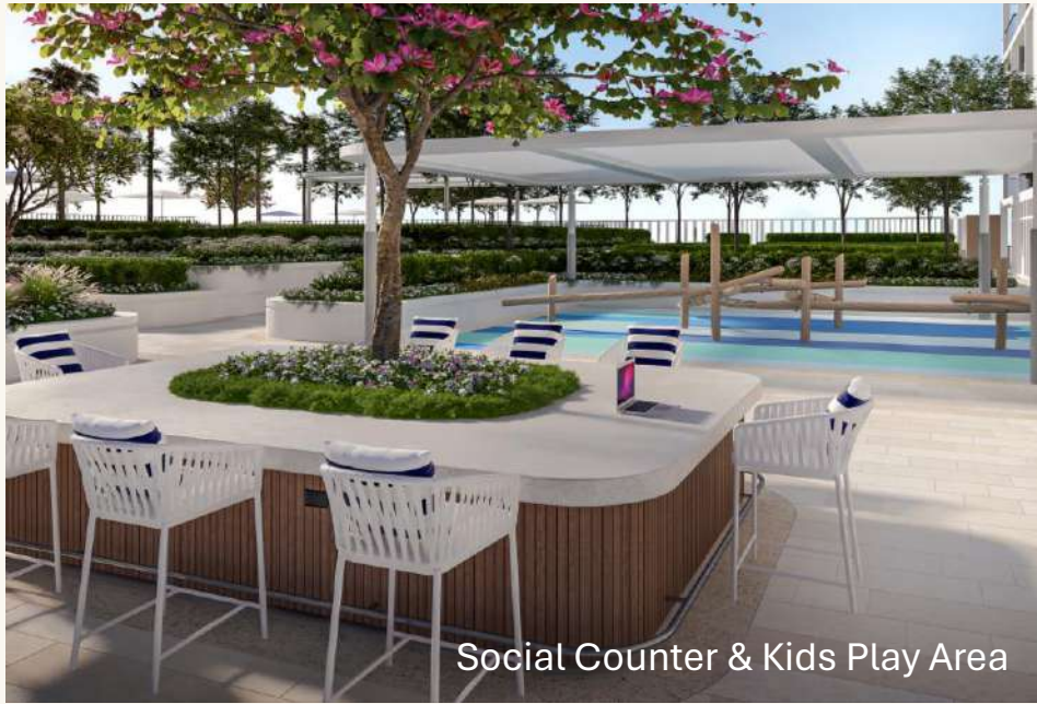
Social Counter & Kids Play Area