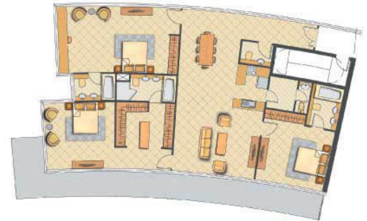
3 BEDROOM FLOOR PLAN