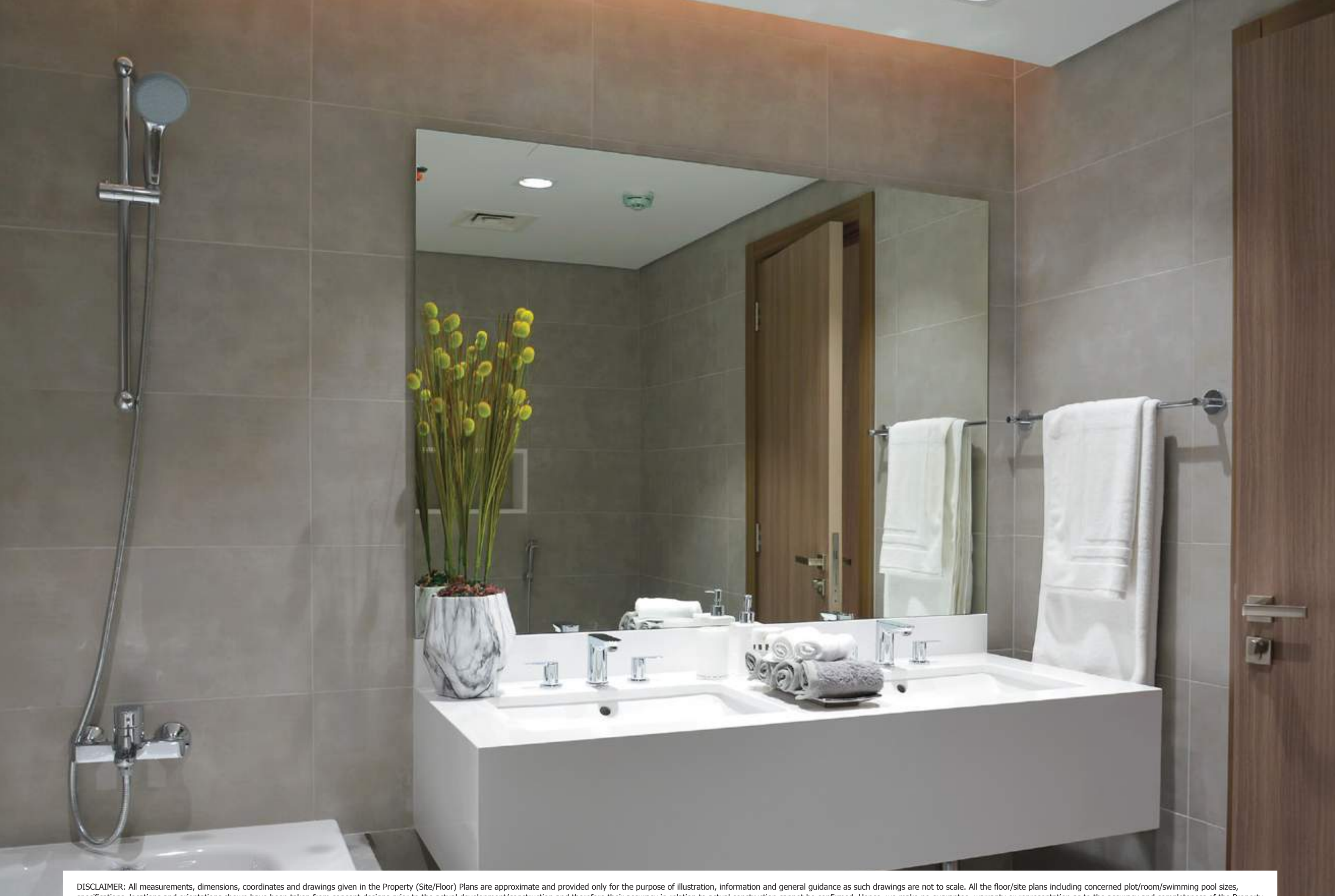
DISCLAIMER: All measurements, dimensions, coordinates and drawings given in the Property (Site/Floor) Plans are approximate and provided only for the purpose of illustration, information and general guidance as such drawings are not to scale. All the floor/site plans including concerned plot/room/swimming pool sizes, specifications, locations and orientations shown have been taken from concept designs prior to the accuracy and completeness of the Property (Site/Floor) plan information as changes may be made during the development process, without notice. Always refer to latest IFC design available in the sales office for the most accurate representation of all construction details.