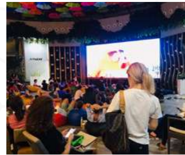
Spend lively afternoons at the events park, sample something new at the outdoor food market or host a barbecue by the lake as you camp out for the night..