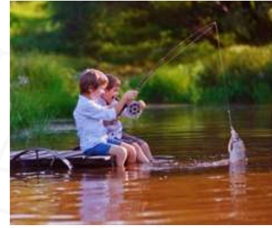
Nature takes pride of place at the Green Zone. But it's just as blissful by the fishing lake or make new friends at the stables, petting farm and dog park.