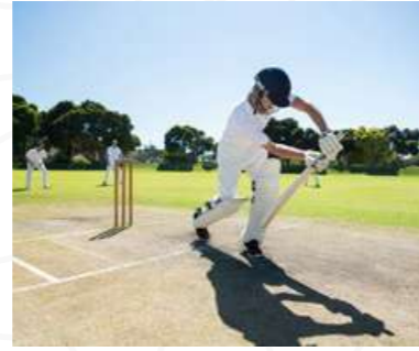
There's everything to play for with world-class venues and facilities for tennis, football, cricket, volleyball, basketball and other sports.