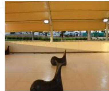
Little golfers can get started with mini golf while the more adventurous ones learn new tricks at the Skate Park and the outdoor Ice Rink.