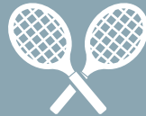
Squash & Tennis Court