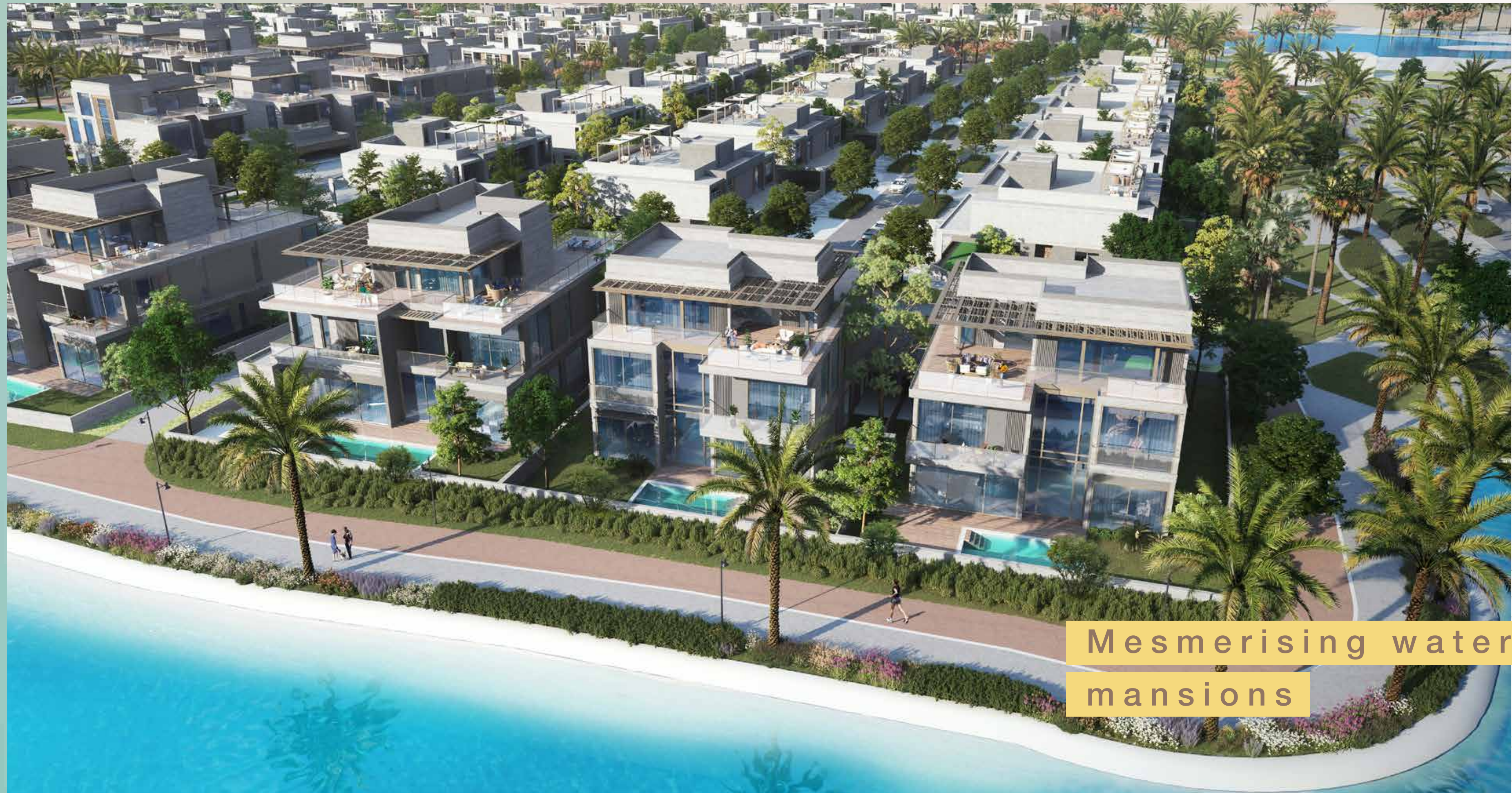
Mesmerising waterfront mansions