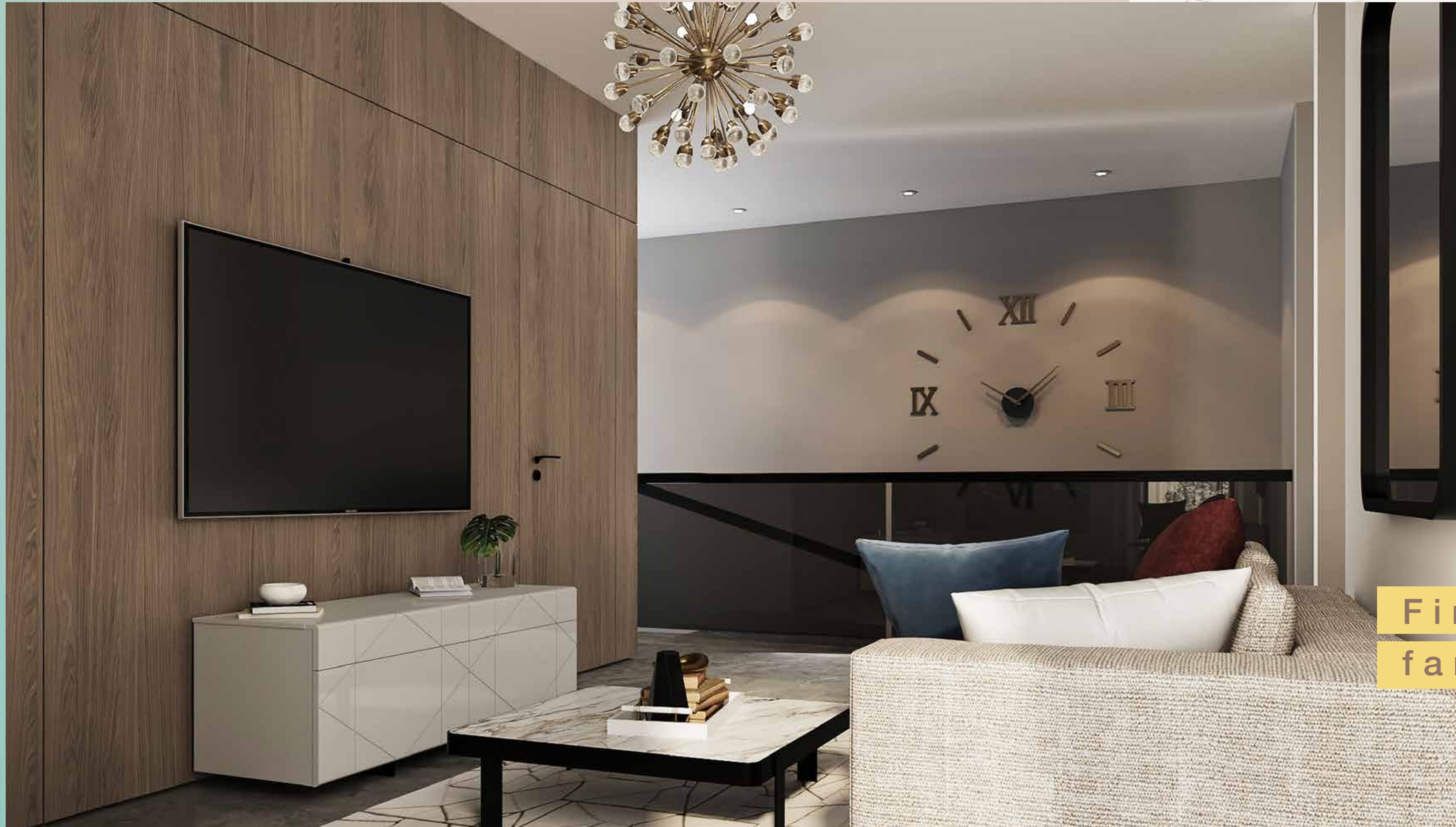
First floor family room