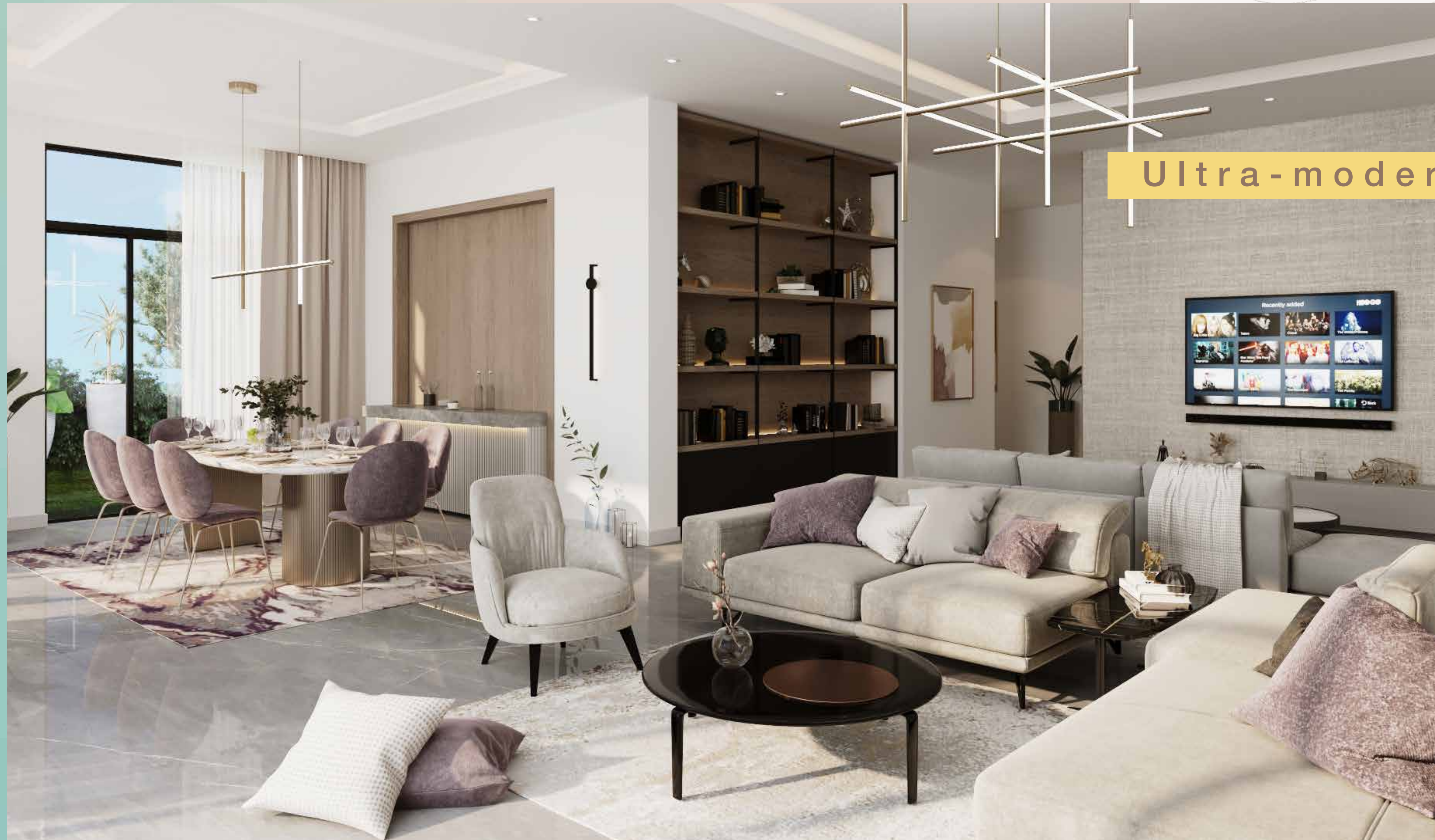
Ultra-modern living room