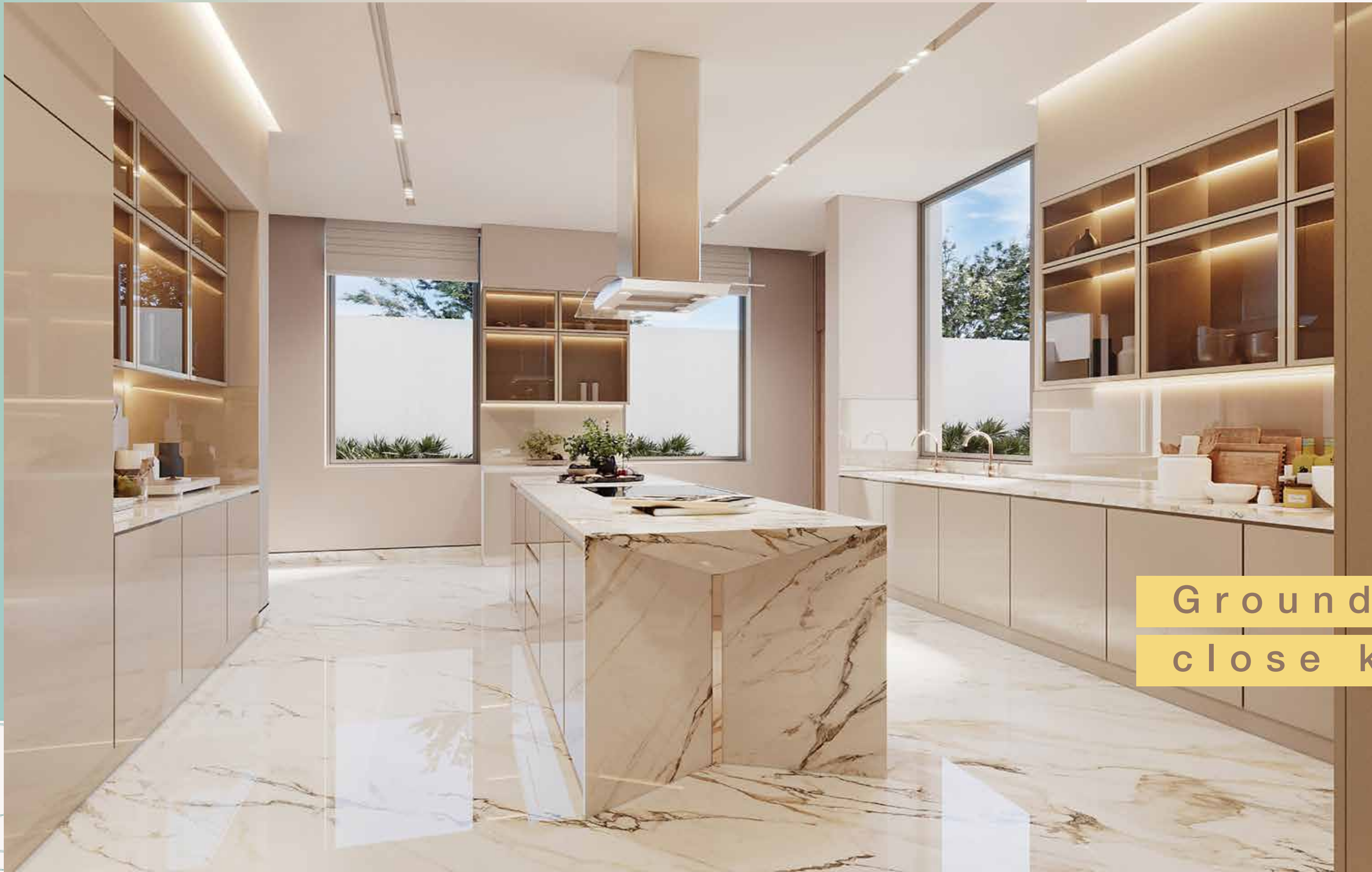
Ground floor close kitchen