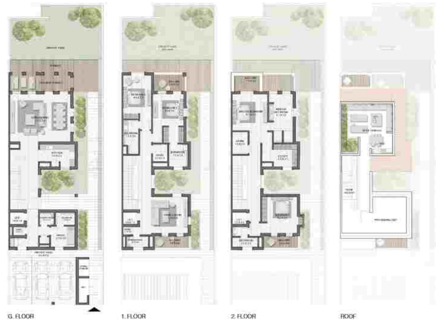
4 BEDROOM (TYPE E) + FAMILY ROOM E TOTAL AREA 445 sqm | 4,795 sqft