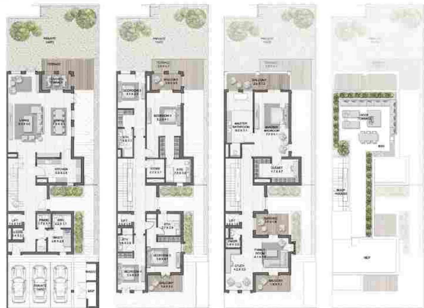
G. FLOOR 1. FLOOR 2. FLOOR ROOF