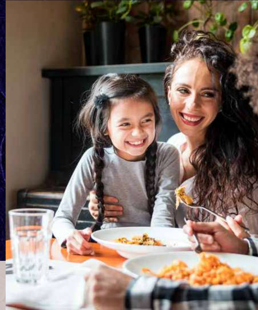
Kids eat free