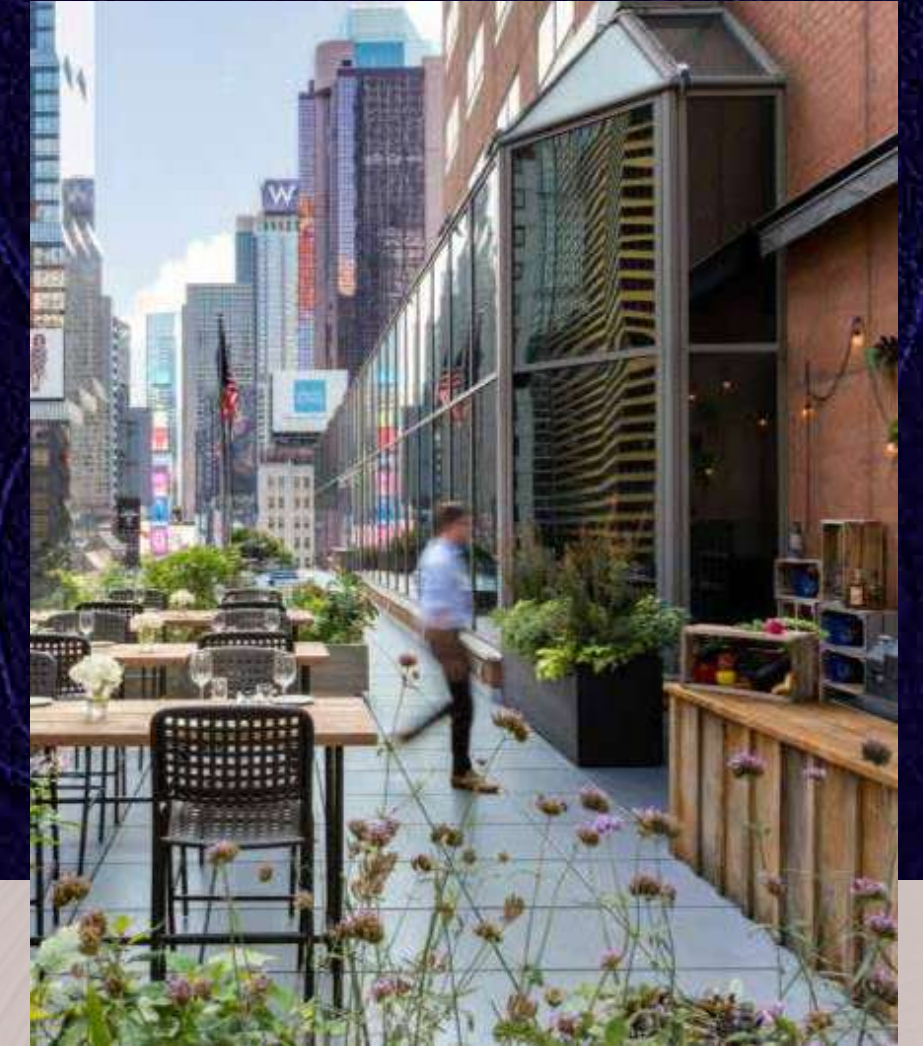
Exclusive invitations to Prestige events