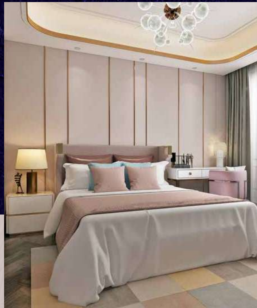
Early check-in/ Late check-out