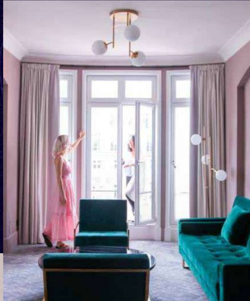
Room upgrades to the next category