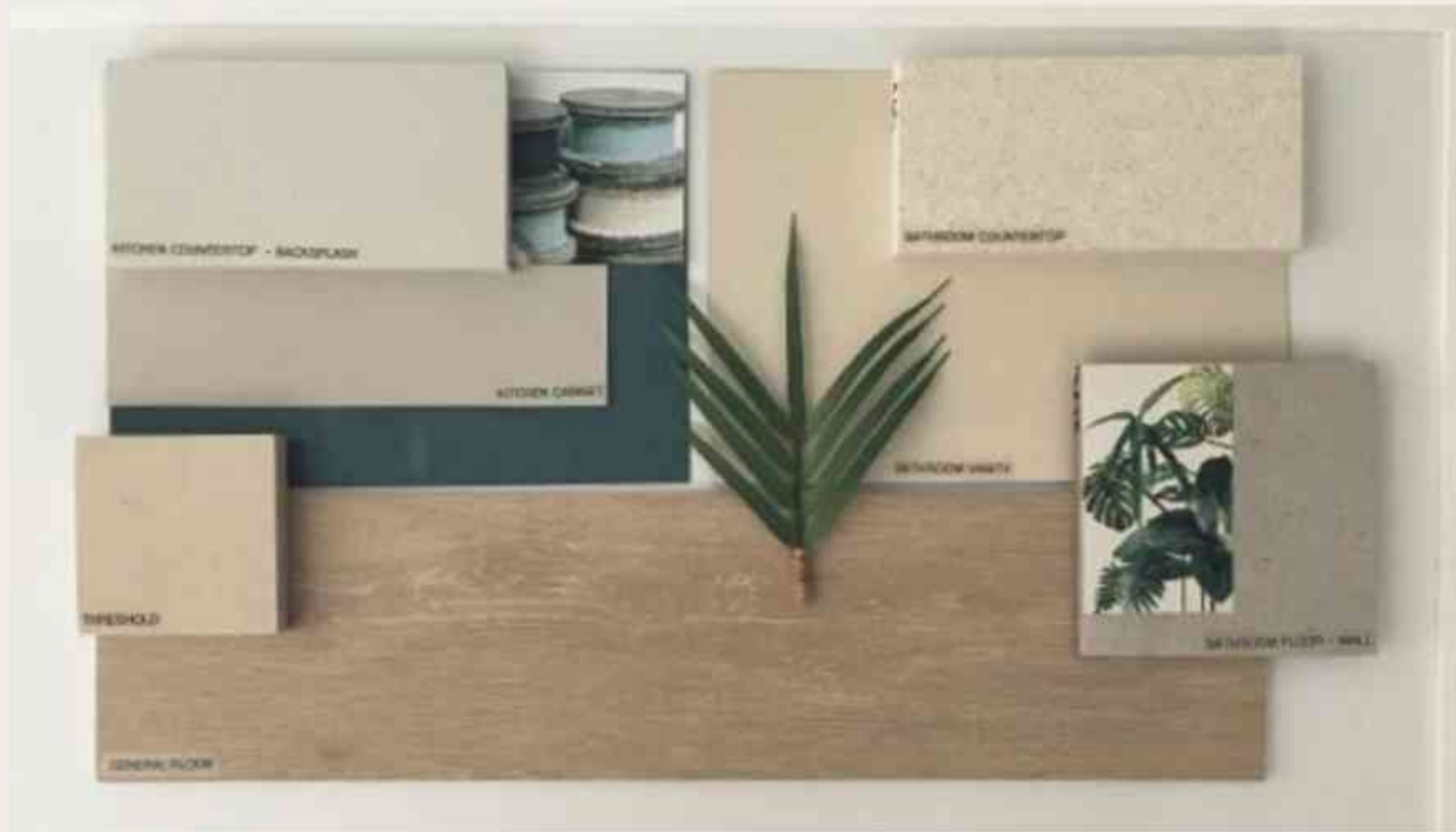
INTERIOR DESIGN SCHEME