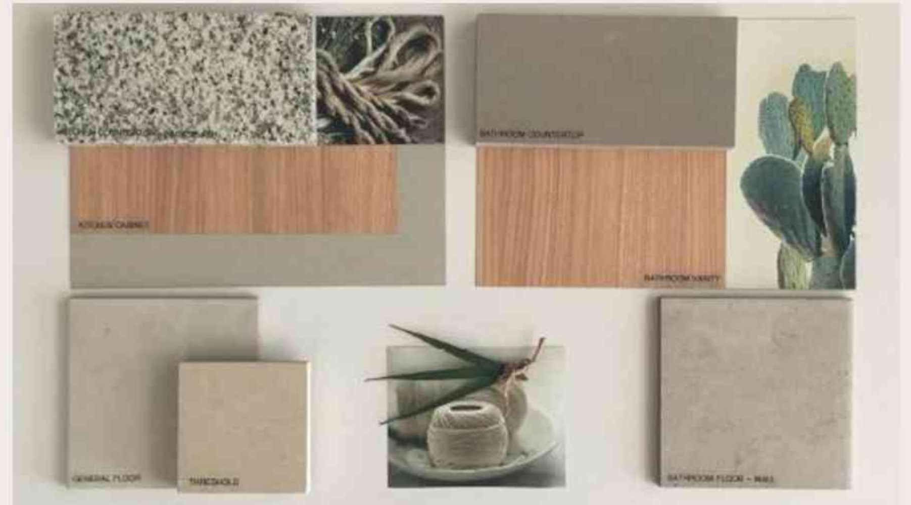
INTERIOR DESIGN SCHEME