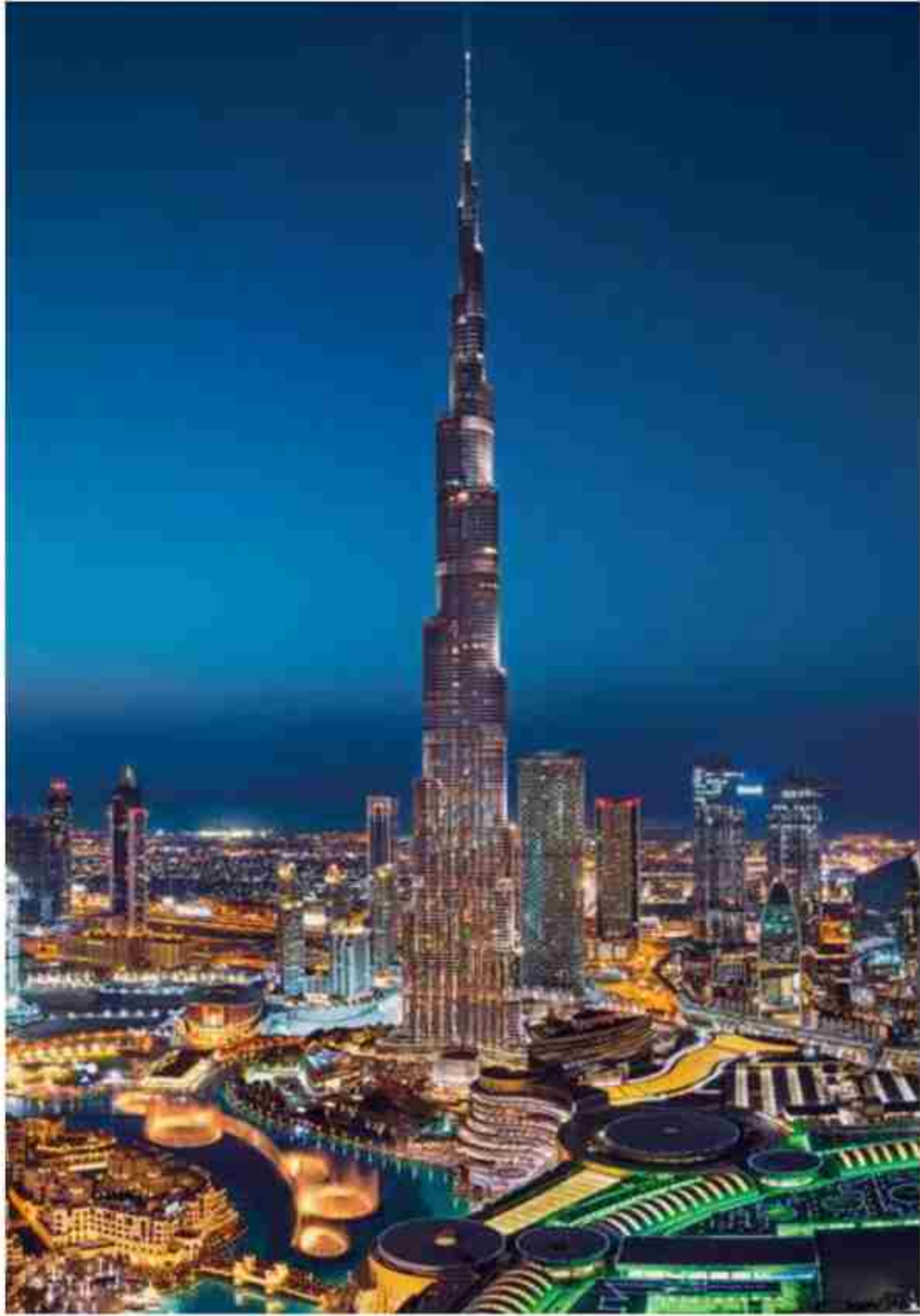
BURJ KHALIFA The world's tallest building