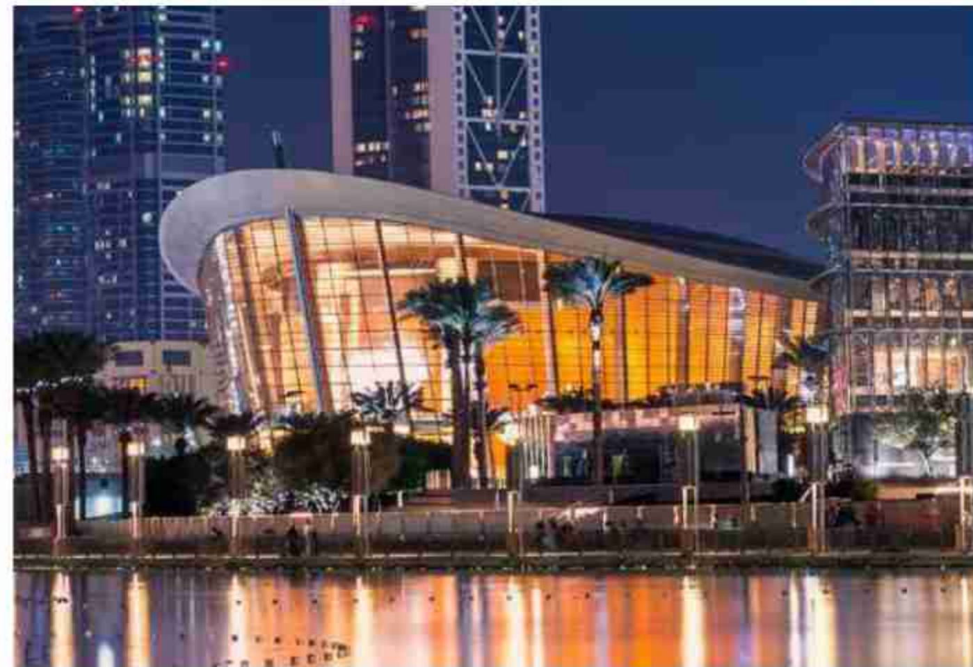
THE DUBAI OPERA 2000 seat multi-format venue