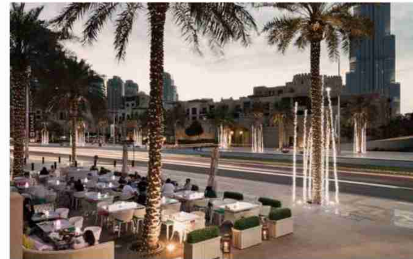
SHEIKH MOHAMMED BIN RASHID BOULEVARD Trendy cafés and restaurants