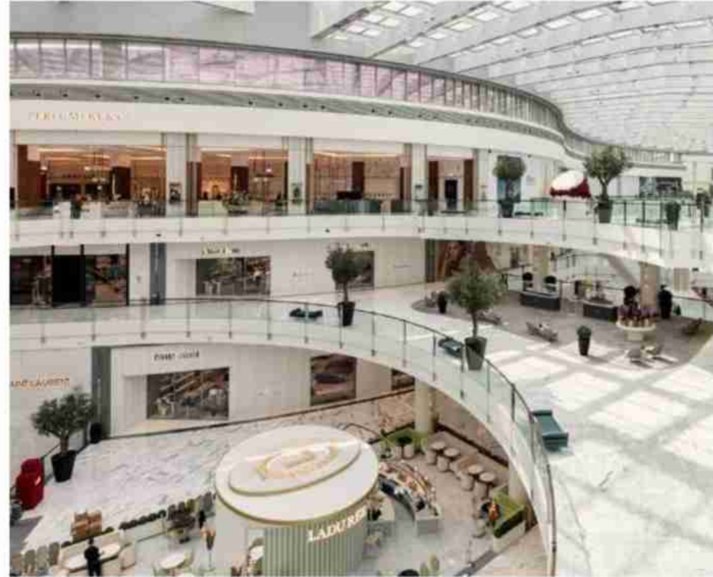
THE DUBAI MALL The city's most visited retail & entertainment destination