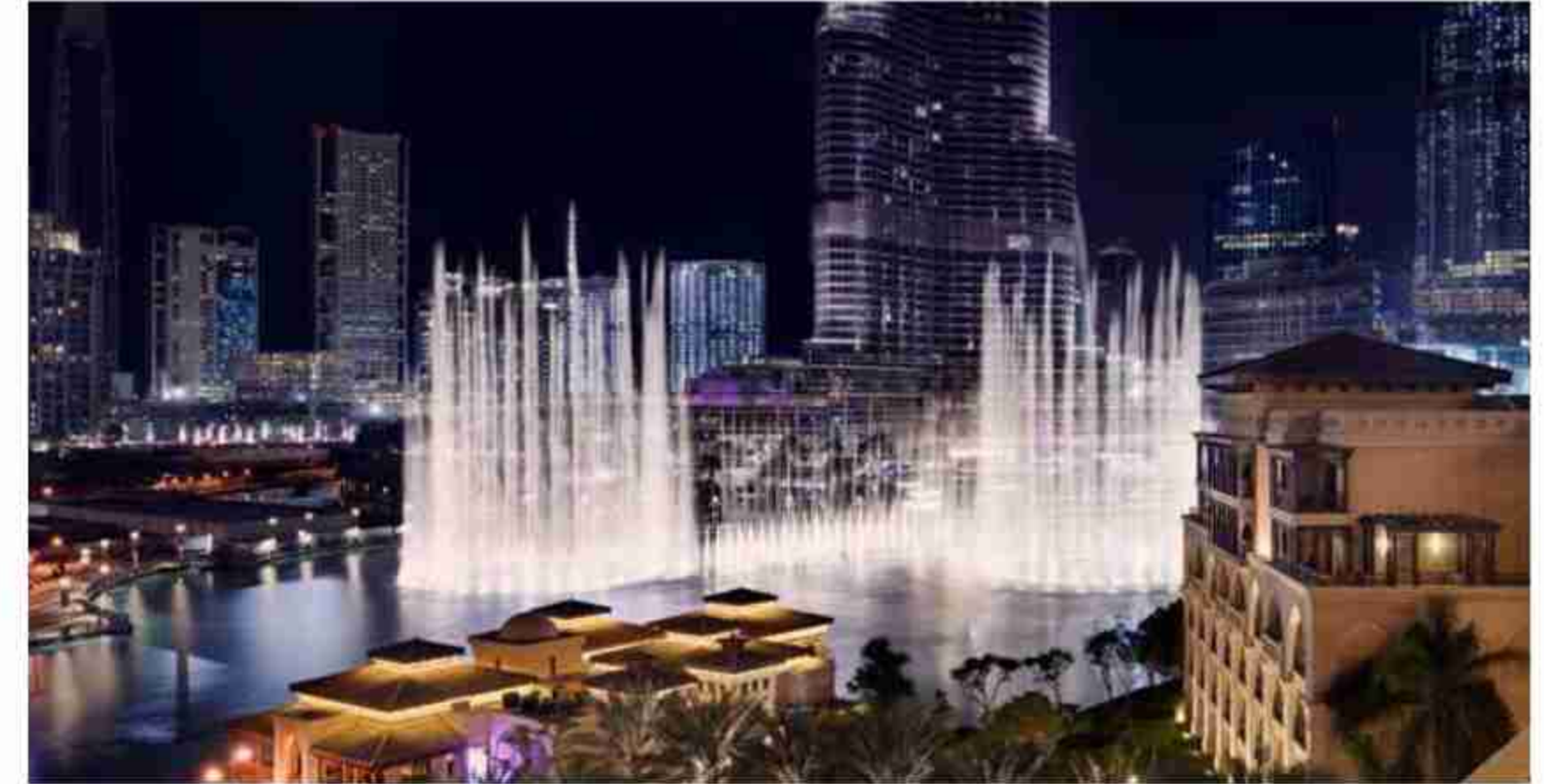
THE DUBAI FOUNTAIN The world's largest choreographed fountain system