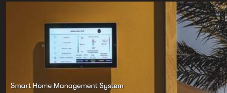
Smart Home Management System