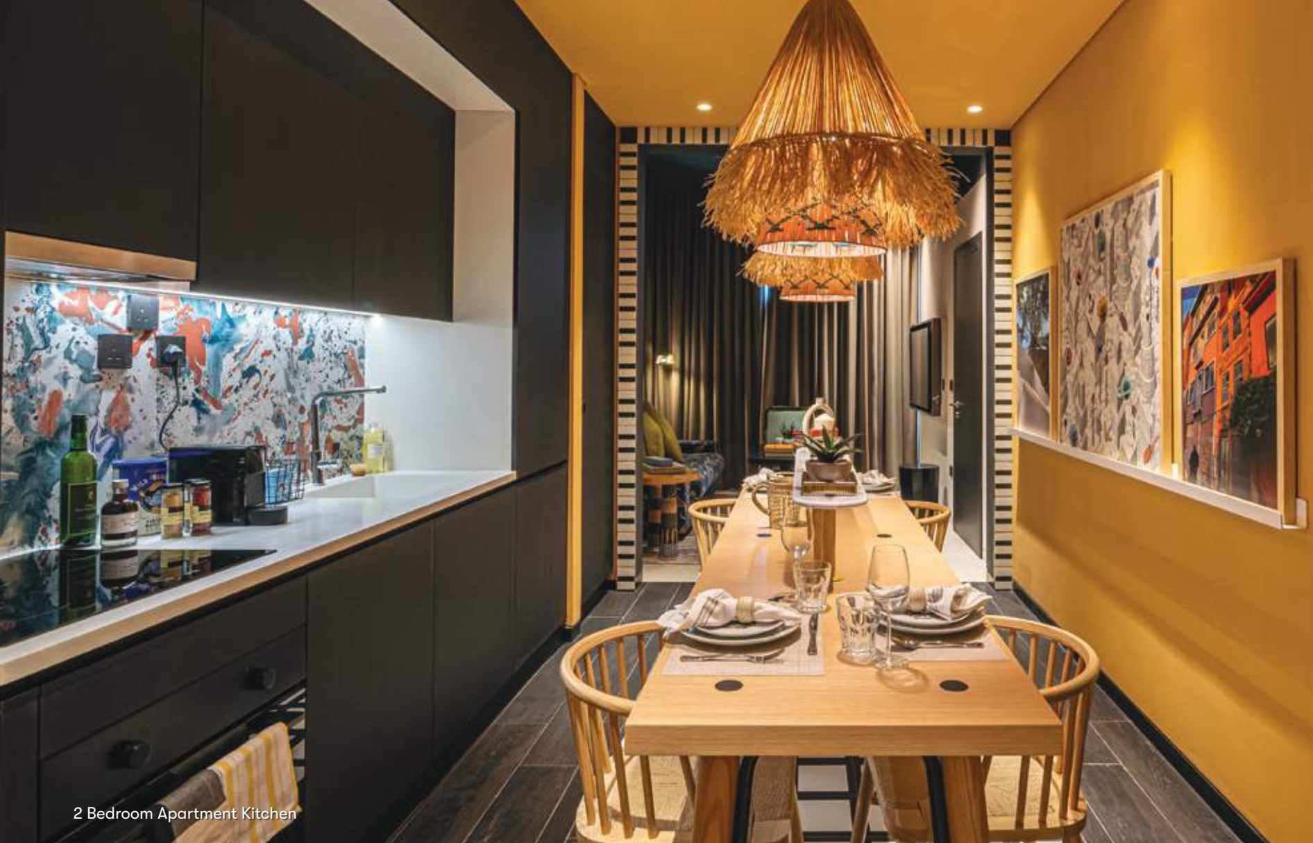
2 Bedroom Apartment Kitchen