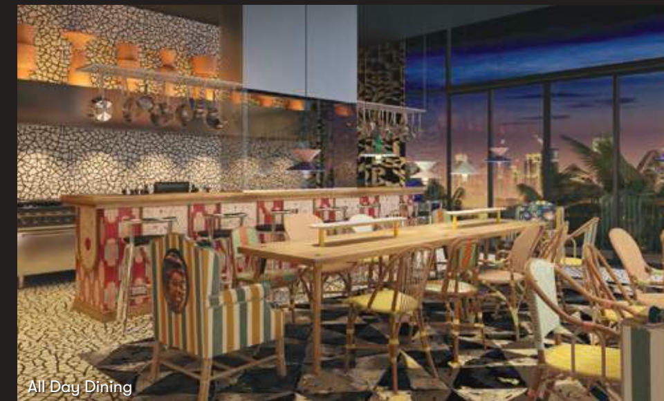
All Day Dining

This is not only a place to live but a place to feast.