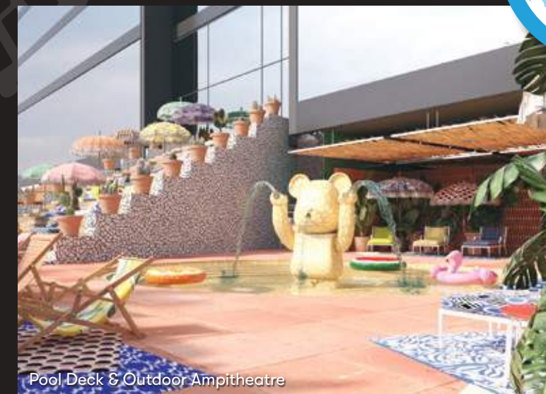
Pool Deck & Outdoor Ampitheatre