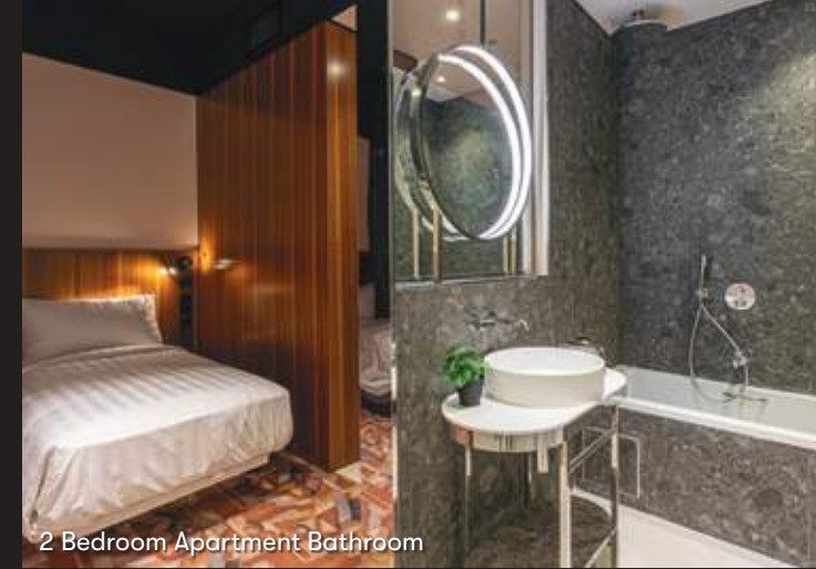
2 Bedroom Apartment Bathroom