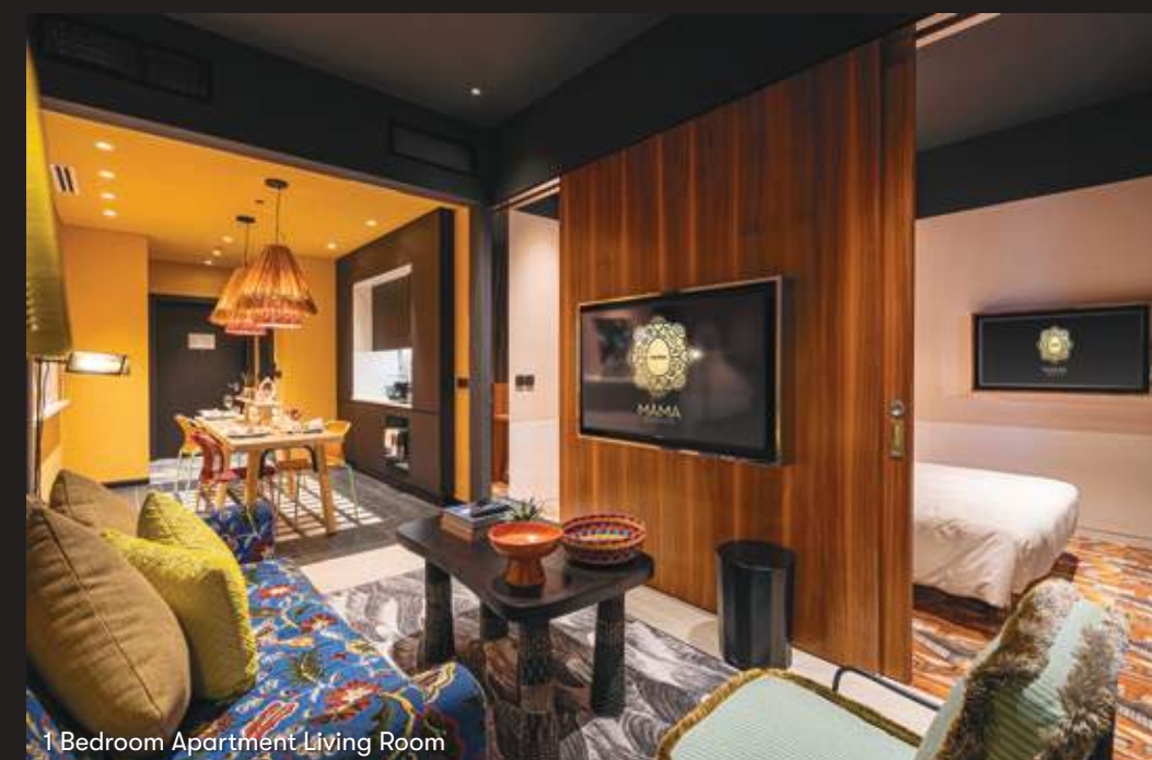
1 Bedroom Apartment Living Room

With exceptional hotel amenities and hospitality services provided by the global lifestyle hotel leader Ennismore to complete the picture, this fusion of world-class, leading hospitality and the ultimate in-home design makes this an unmatched choice in Dubai. Step inside and start living. With personalized free WiFi, a virtual concierge, a top-notch in-room entertainment system with TV and free movies on demand in every apartment... Nothing is too much to imagine for Mama!