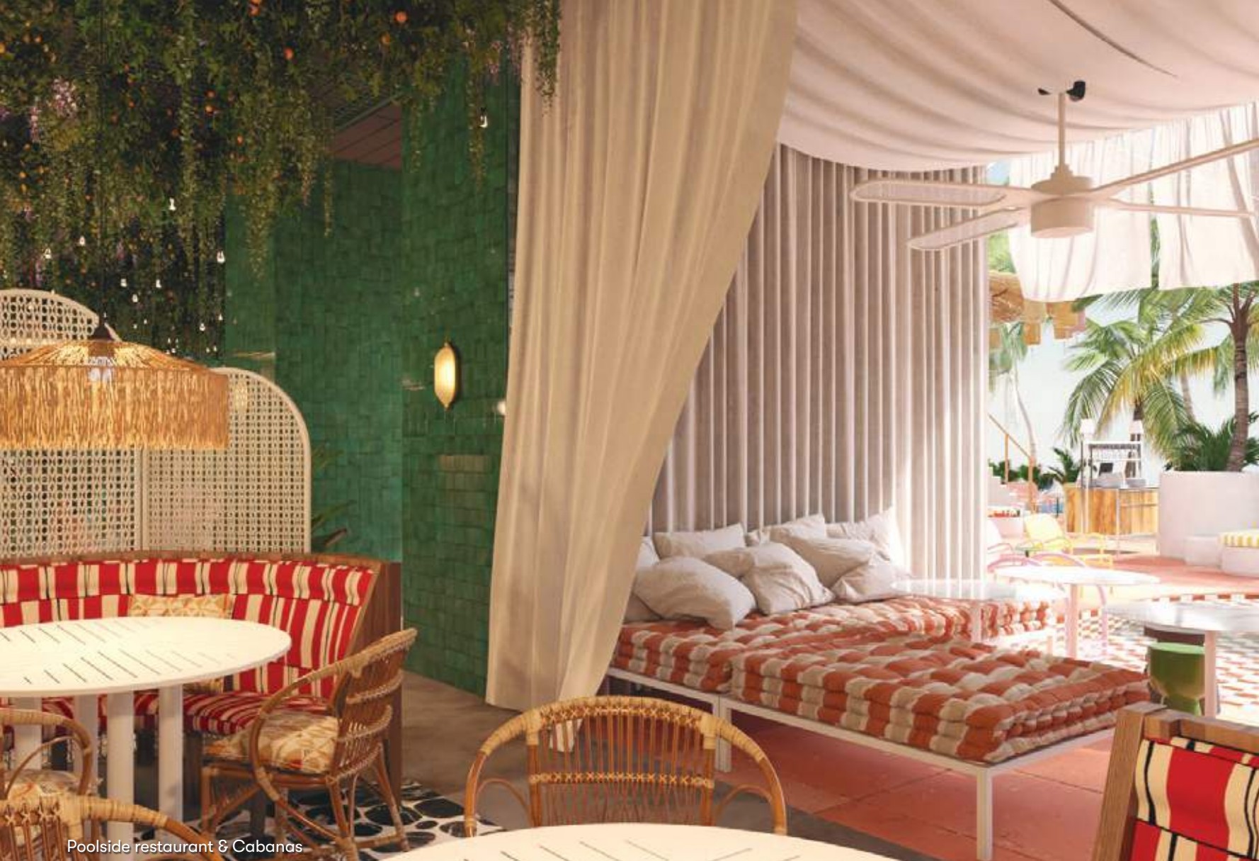
Poolside restaurant & Cabanas