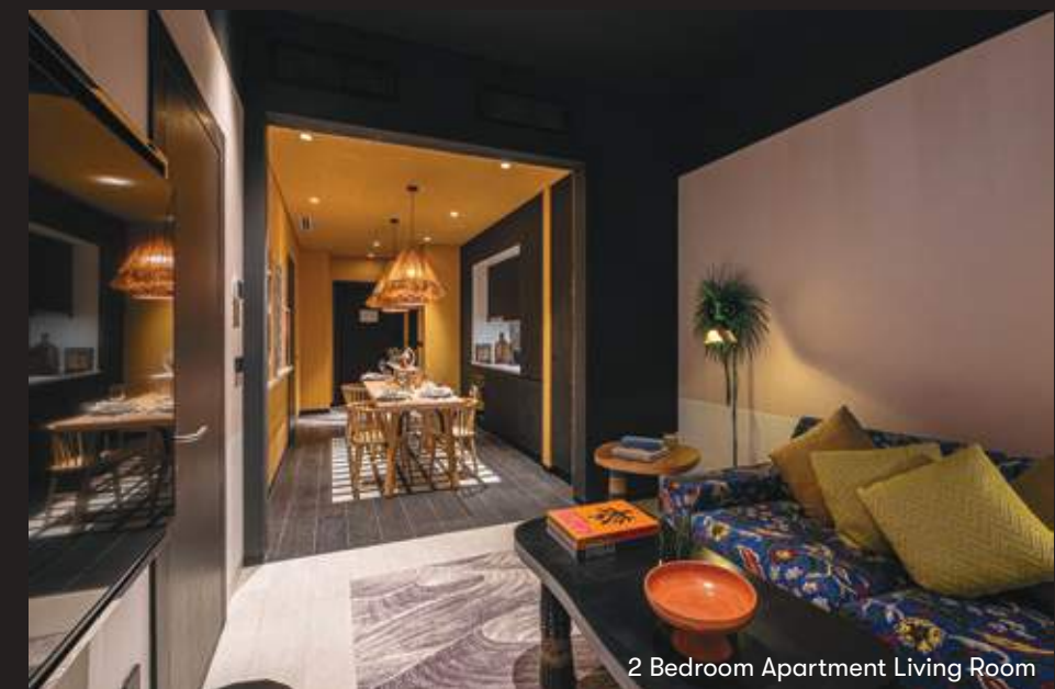
2 Bedroom Apartment Living Room

Mama Residences have been uniquely styled for the skyline around them. Every part of the building hosts art masterpieces that tell the city's story and create an urban haven where the global and the local fuse. Mosaic steps, colorful walls and eccentric hanging decorations brighten up every corner of Mama. You'll never be short on inspiration, and your home base will never be far from the lips of every mover and shaker in town.