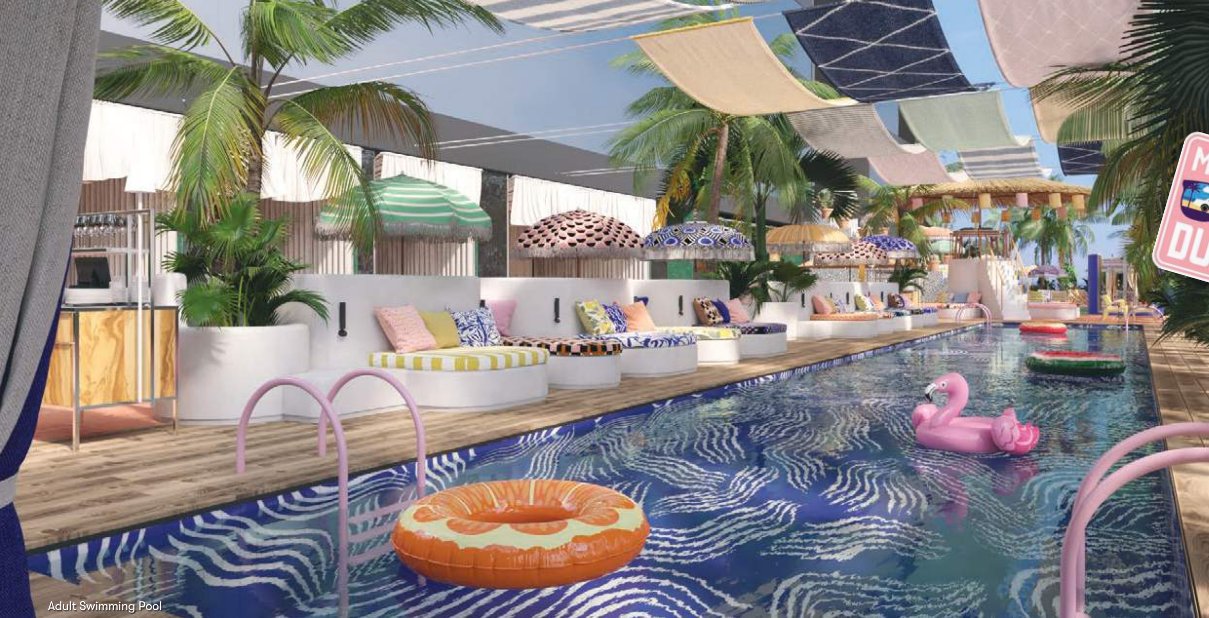
Adult Swimming Pool