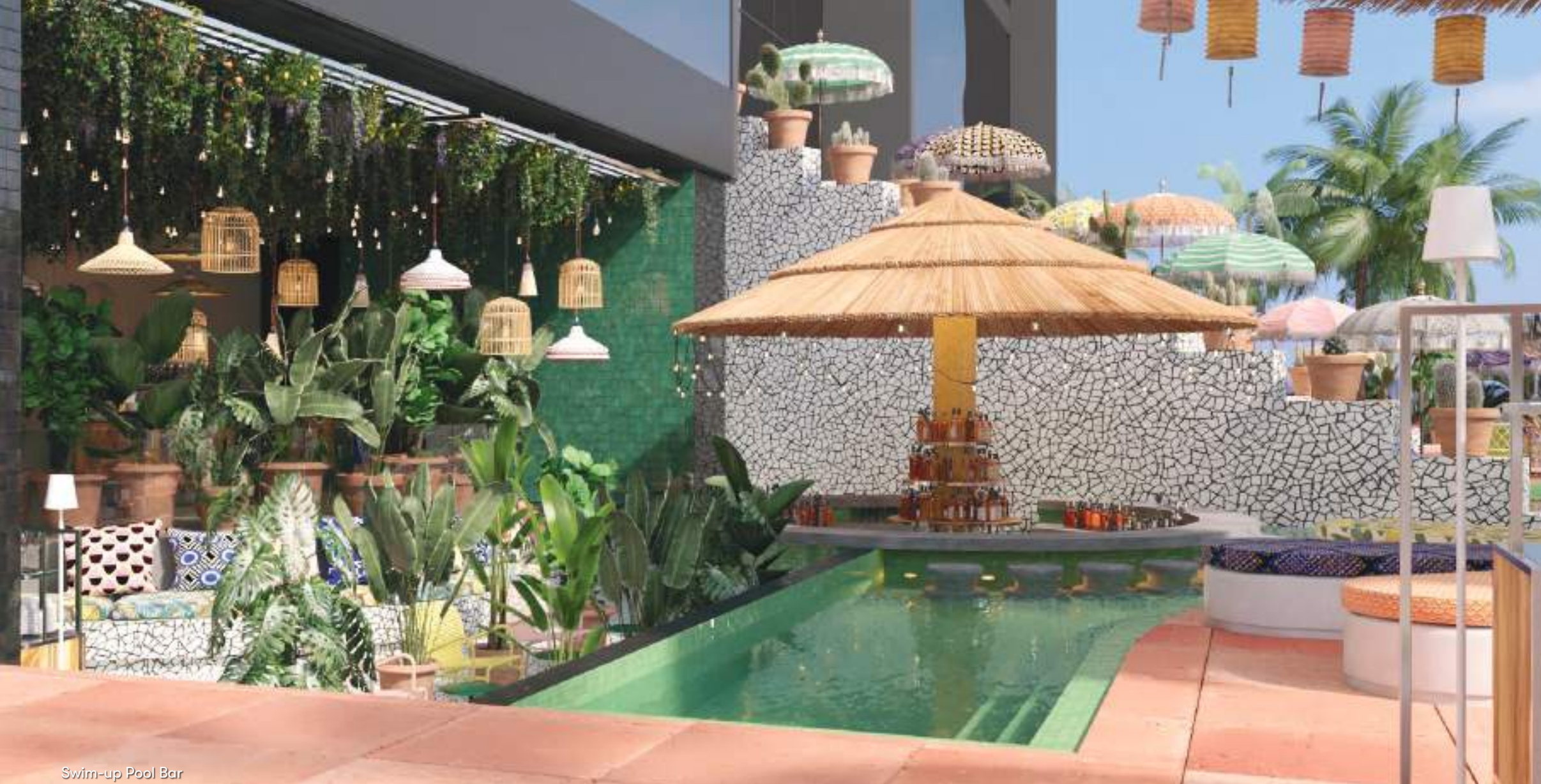
Swim-up Pool Bar