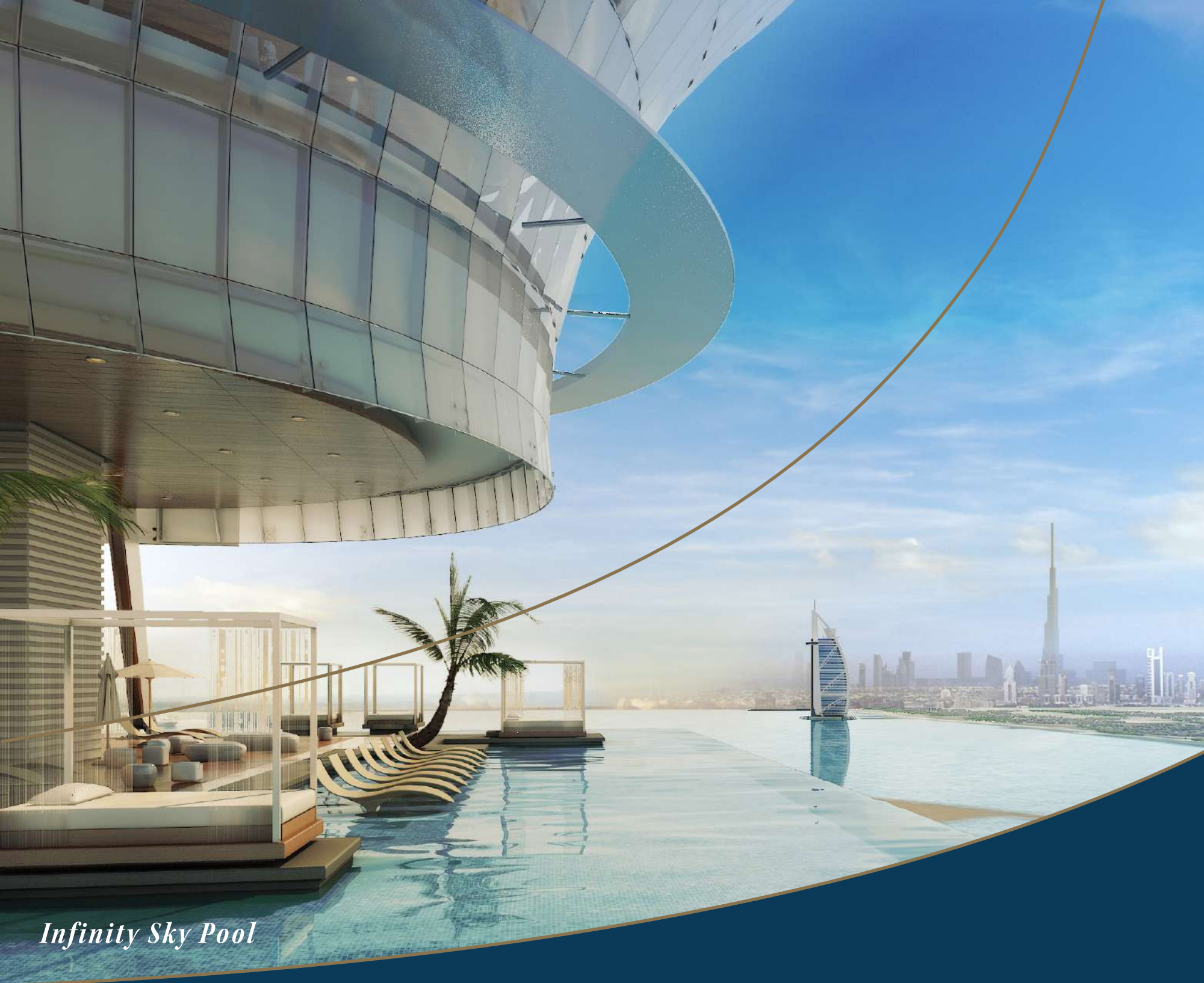
Infinity Sky Pool