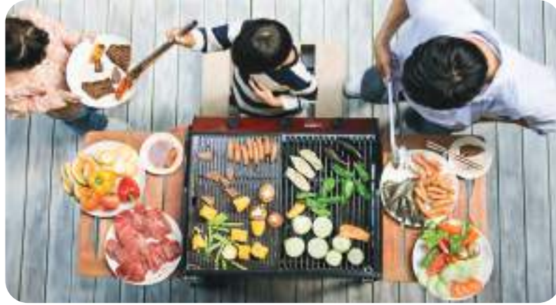
BBQ areas, outdoor dining pavilion