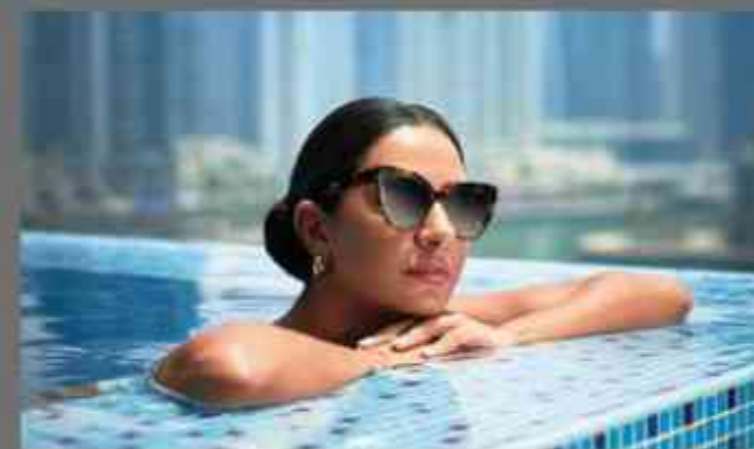
Lifestyle & Experiences