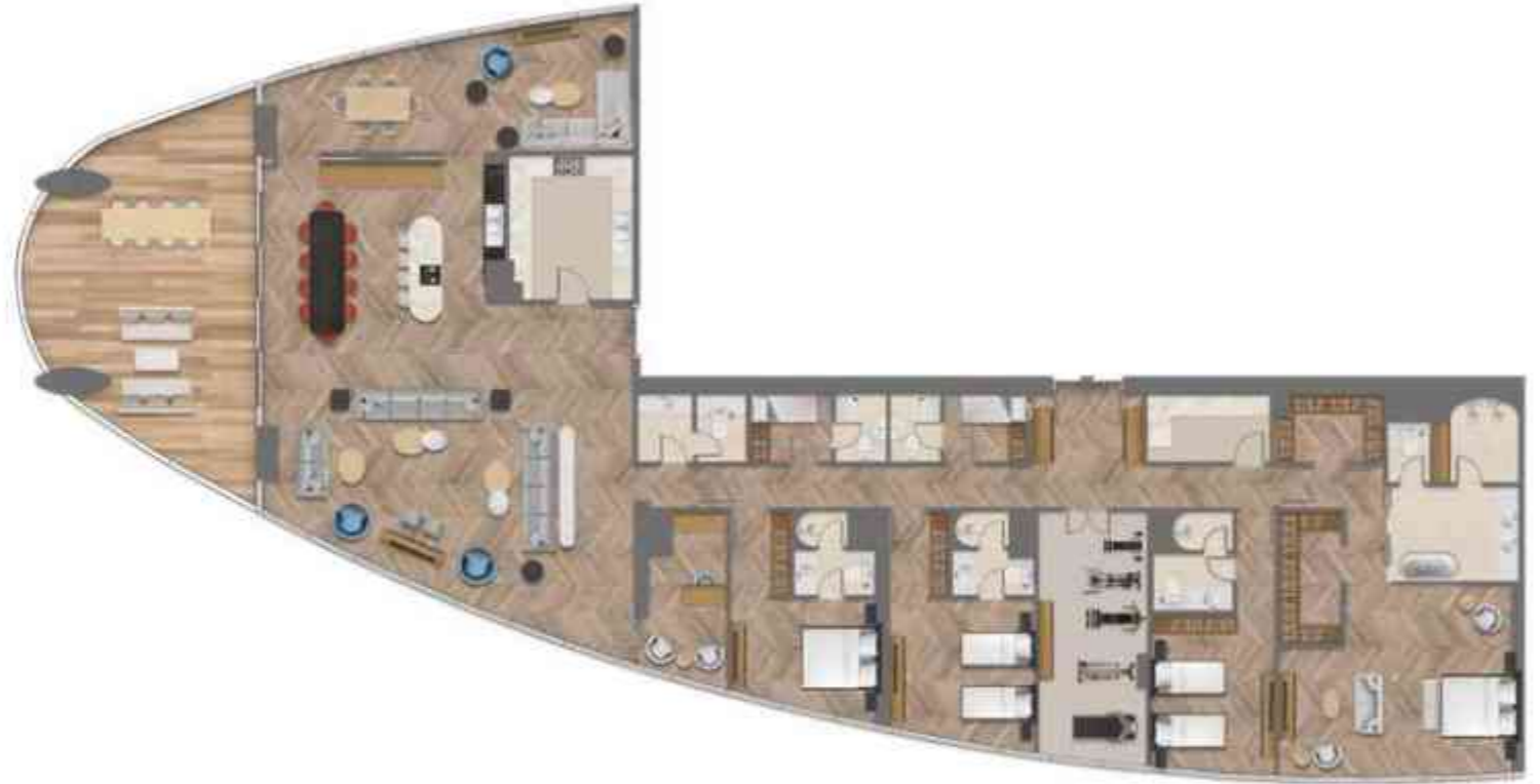
4 BEDROOM APARTMENT, SIMPLEX