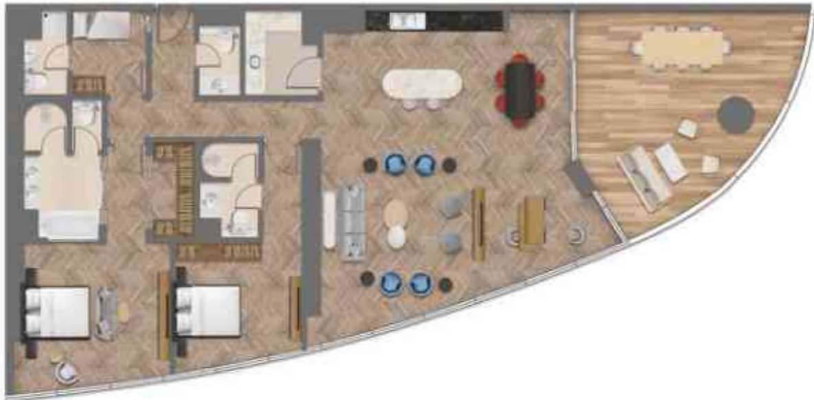
2 BEDROOM APARTMENT, TYPE B