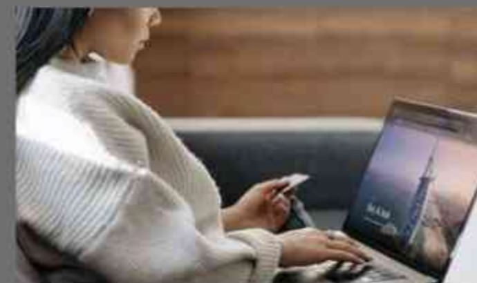
Pay with Points