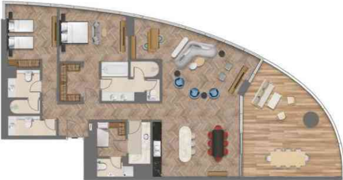
2 BEDROOM APARTMENT, TYPE A