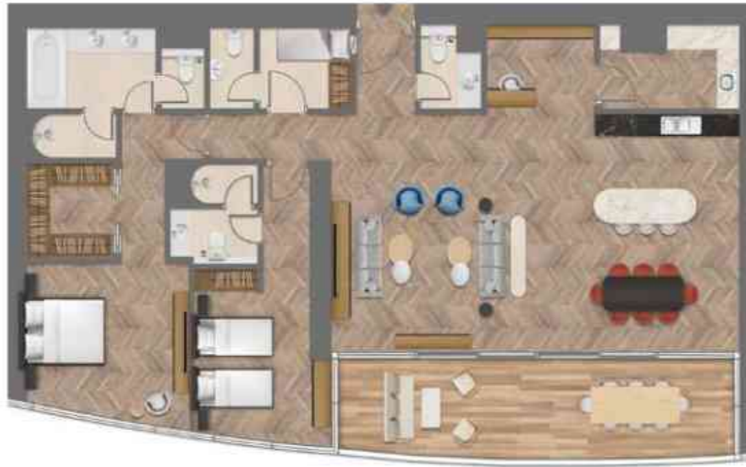
2 BEDROOM APARTMENT, TYPE C