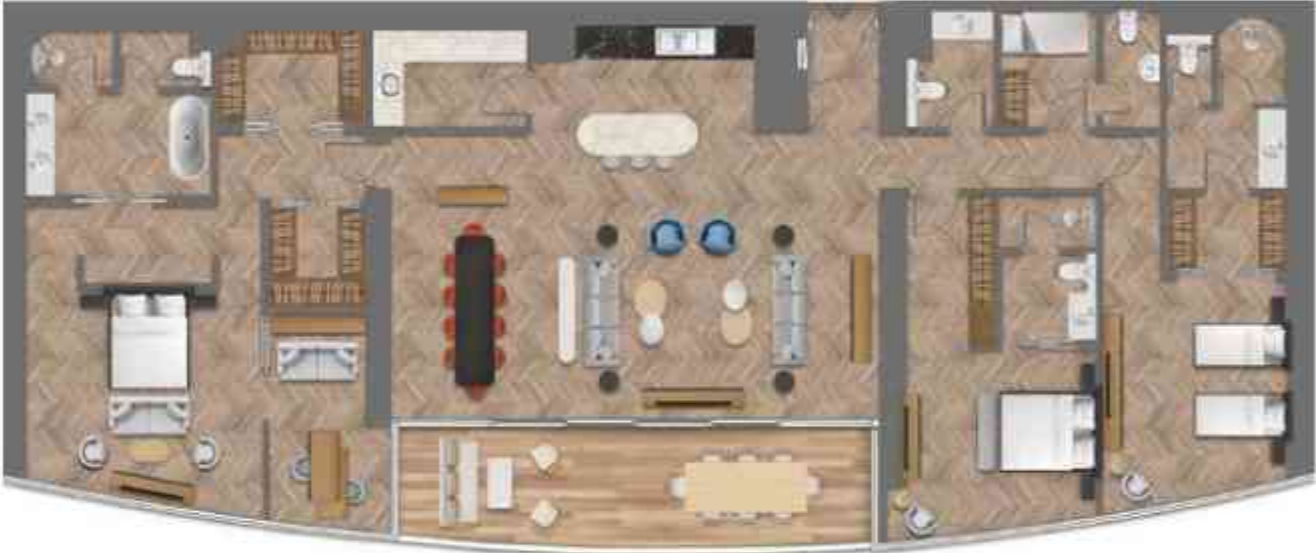
3 BEDROOM APARTMENT, TYPE C