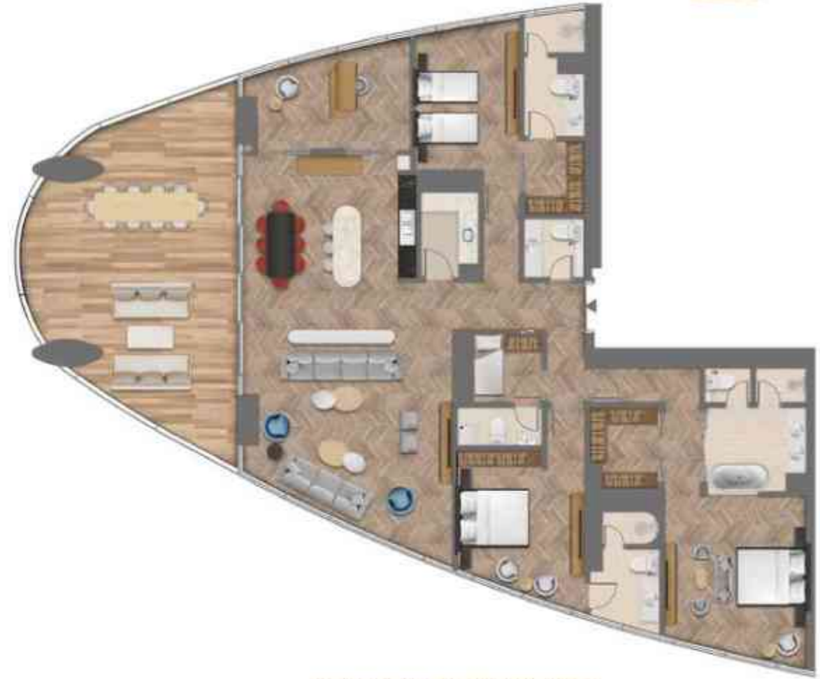
3 BEDROOM APARTMENT, TYPE A