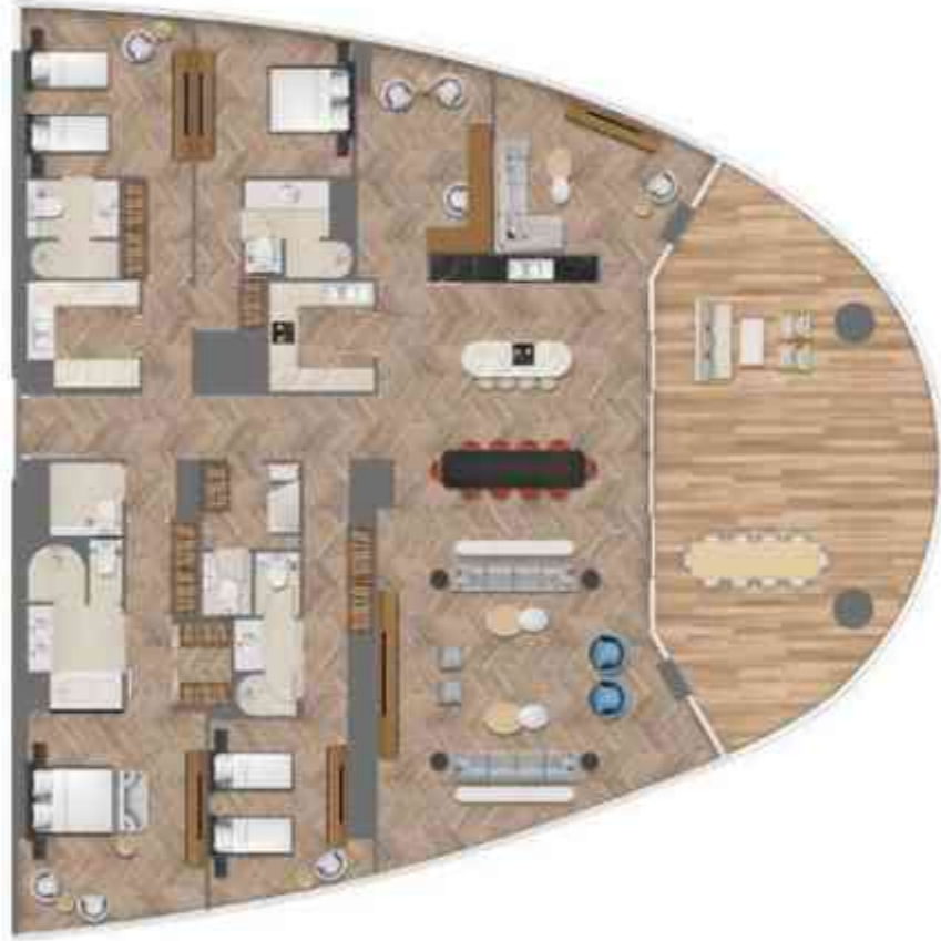
4 BEDROOM APARTMENT, TYPE A