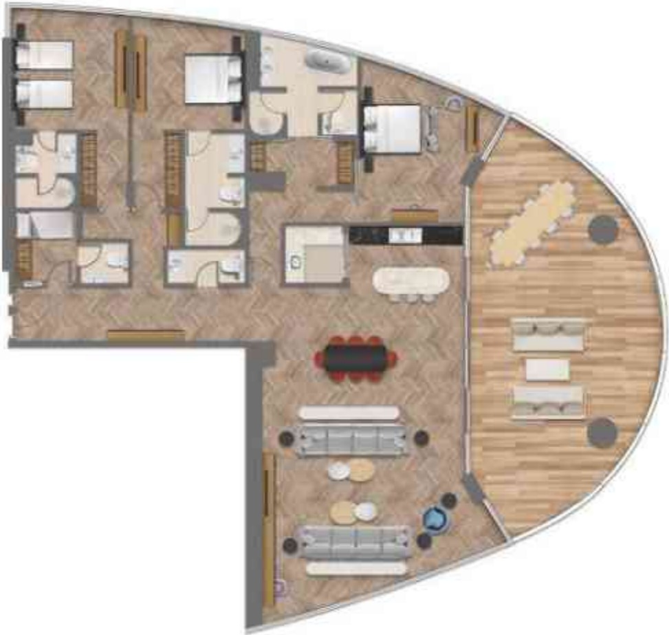
3 BEDROOM APARTMENT, TYPE B