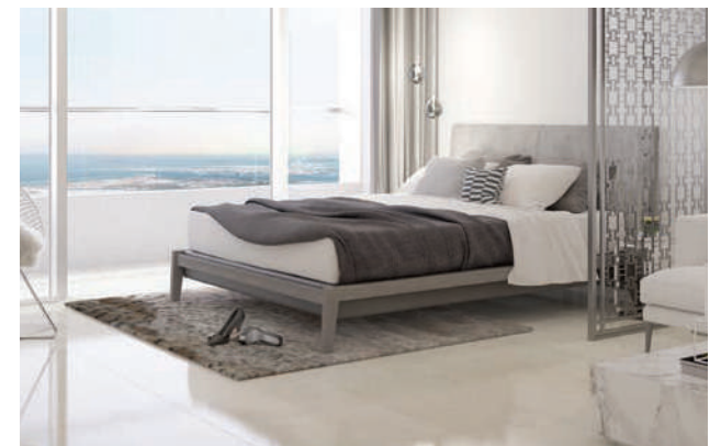
JULPHAR RESIDENCE | ABU DHABI