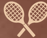
Squash & Tennis Court