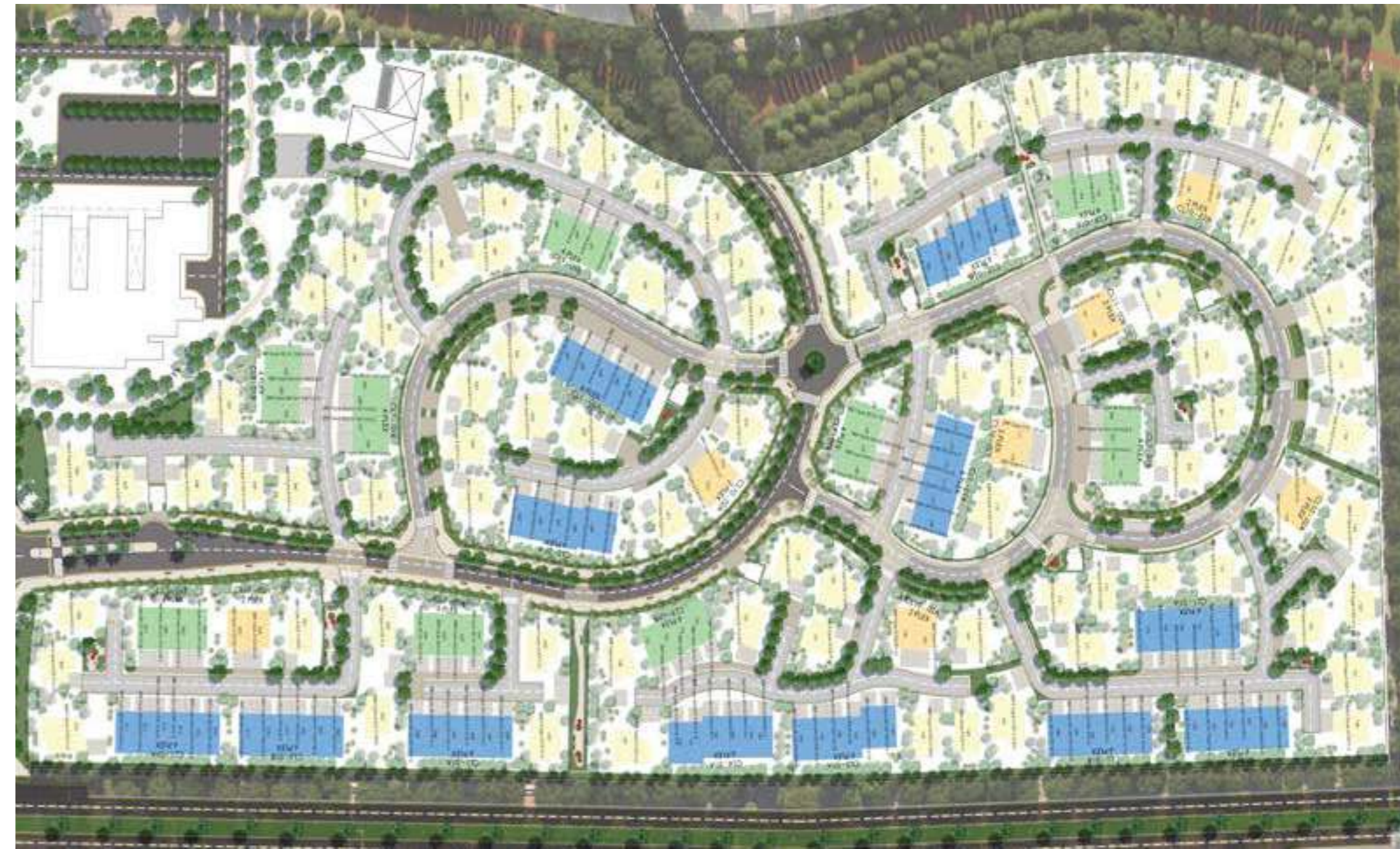
6-PLEX TOWNHOUSE 4-PLEX TOWNHOUSE SEMIDETACHED DETACHED VILLAS