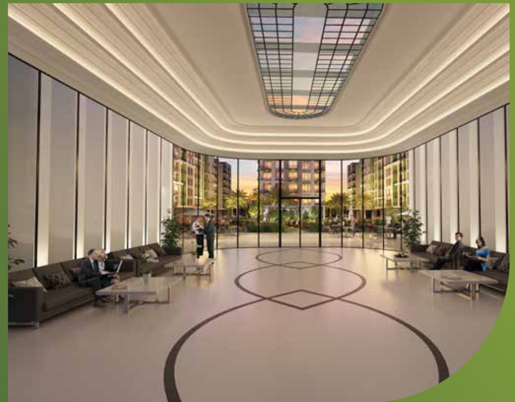
MULTI-PURPOSE PARTY HALL