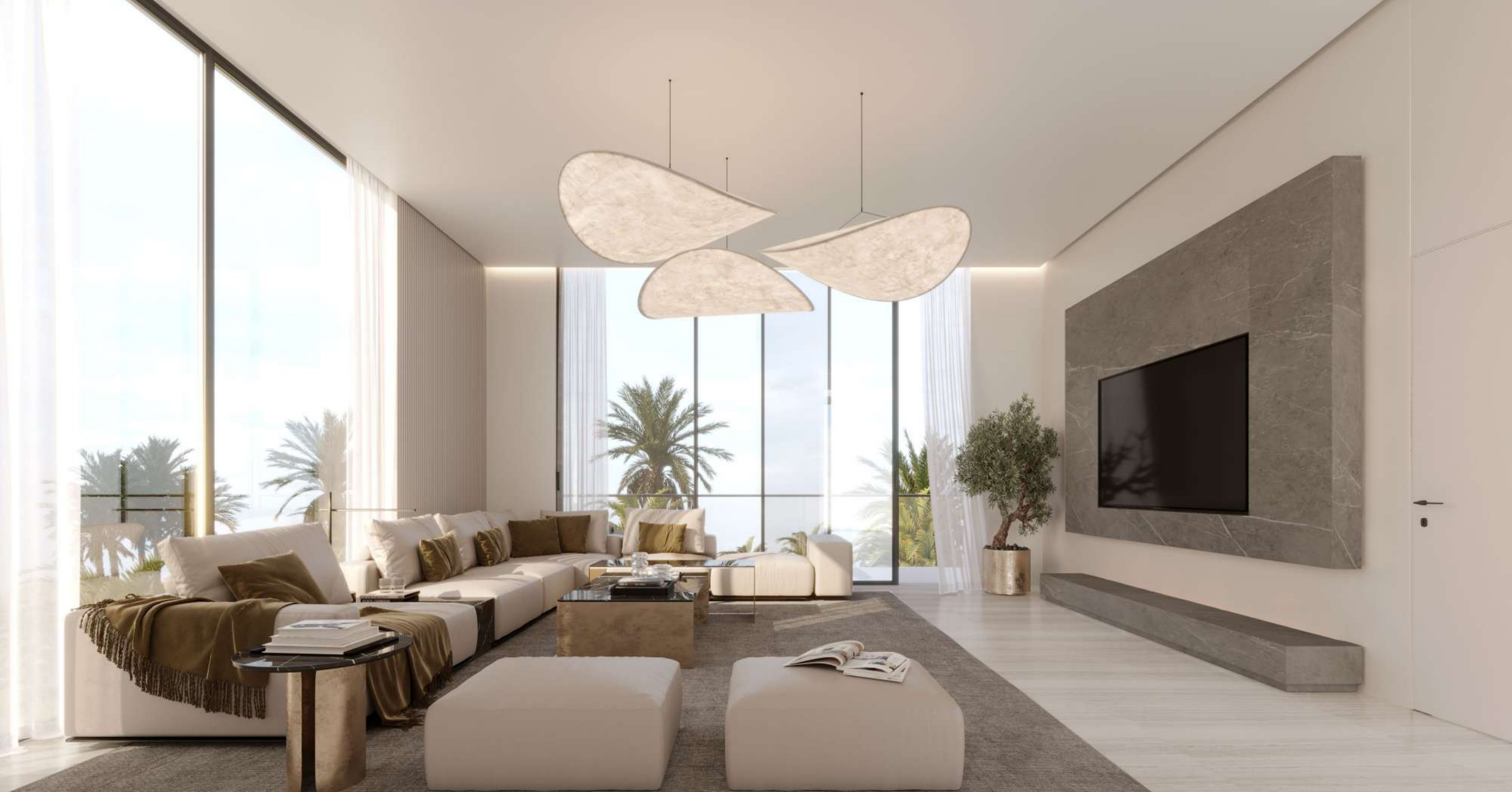
FAMILY LOUNGE FIRST FLOOR