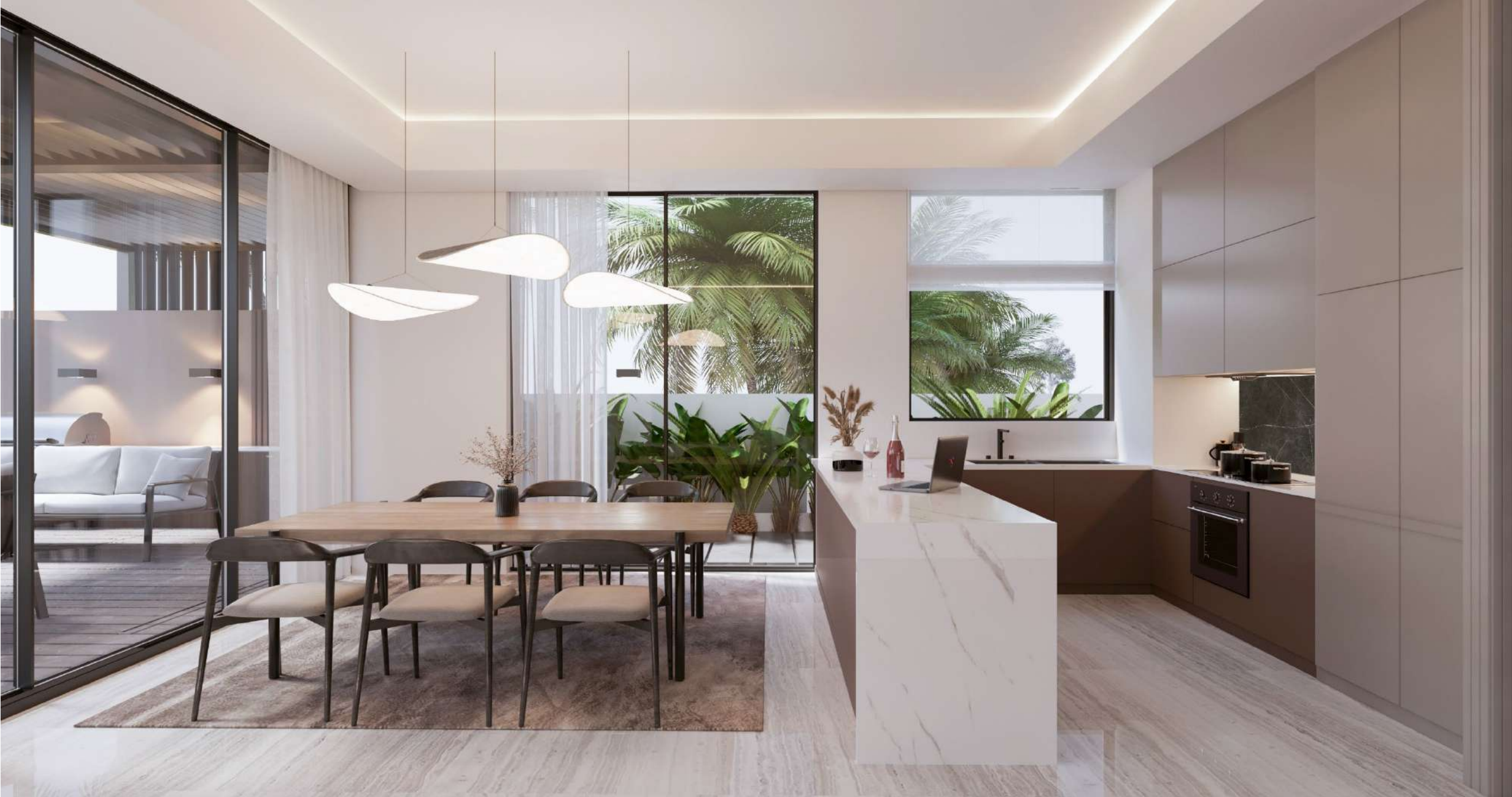
KITCHEN AND DINING