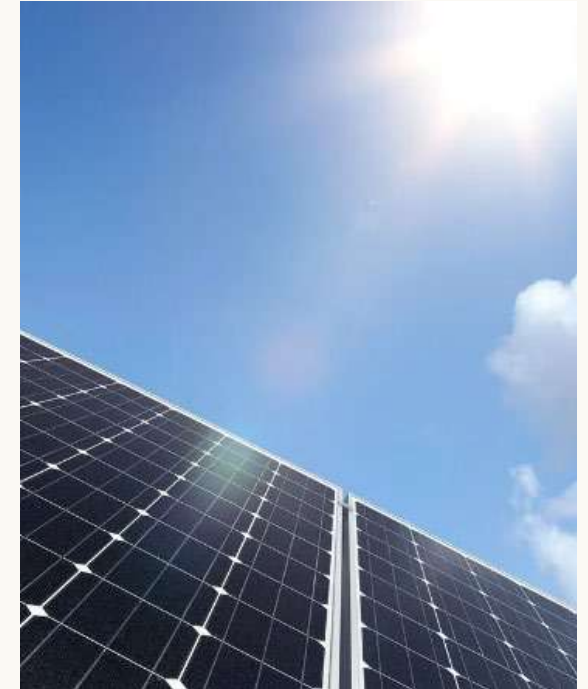
Hot Water System via Solar Heating