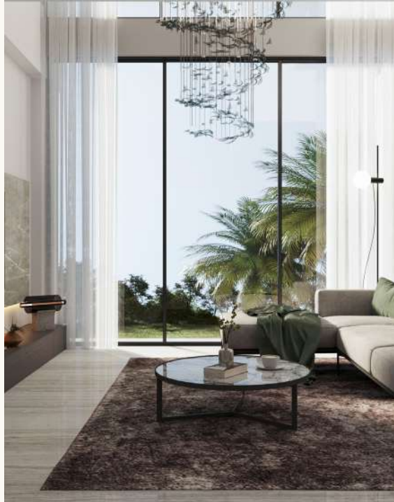
Floor to ceiling windows for internal -external connection