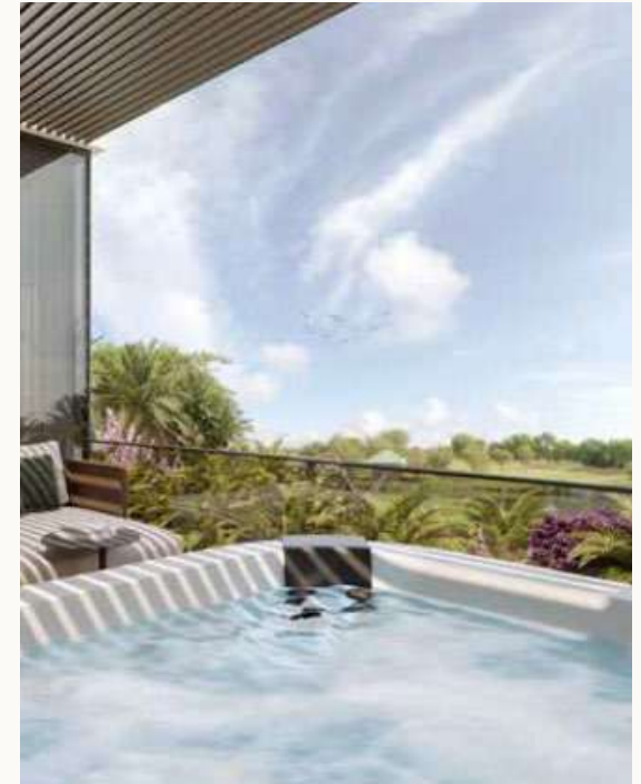
Private pool & jacuzzi