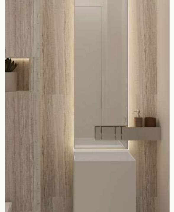
Detailed finishes with high quality materials