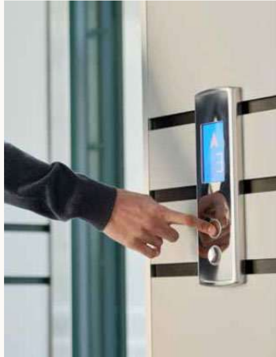
Modern home elevator