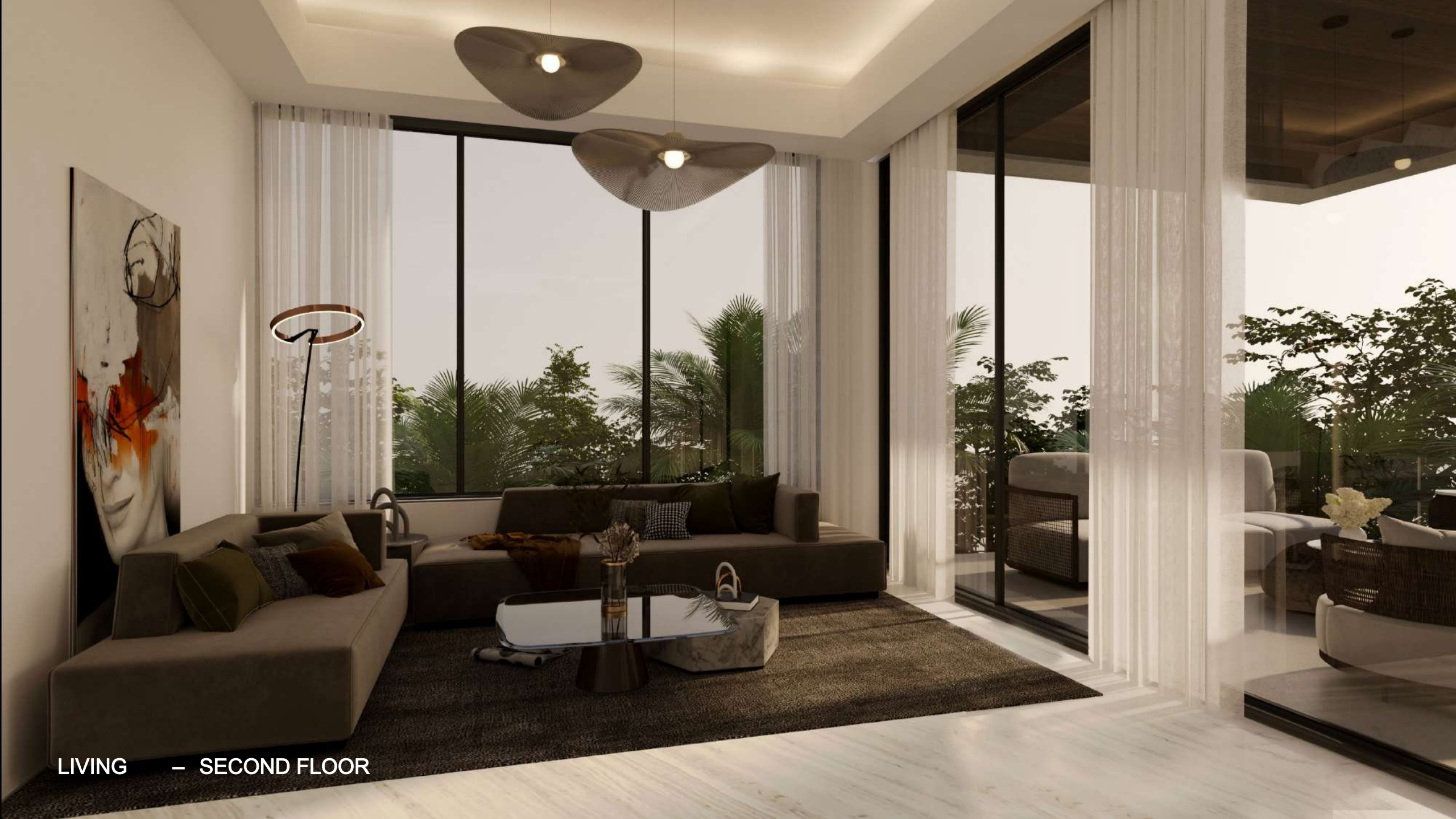
LIVING – SECOND FLOOR