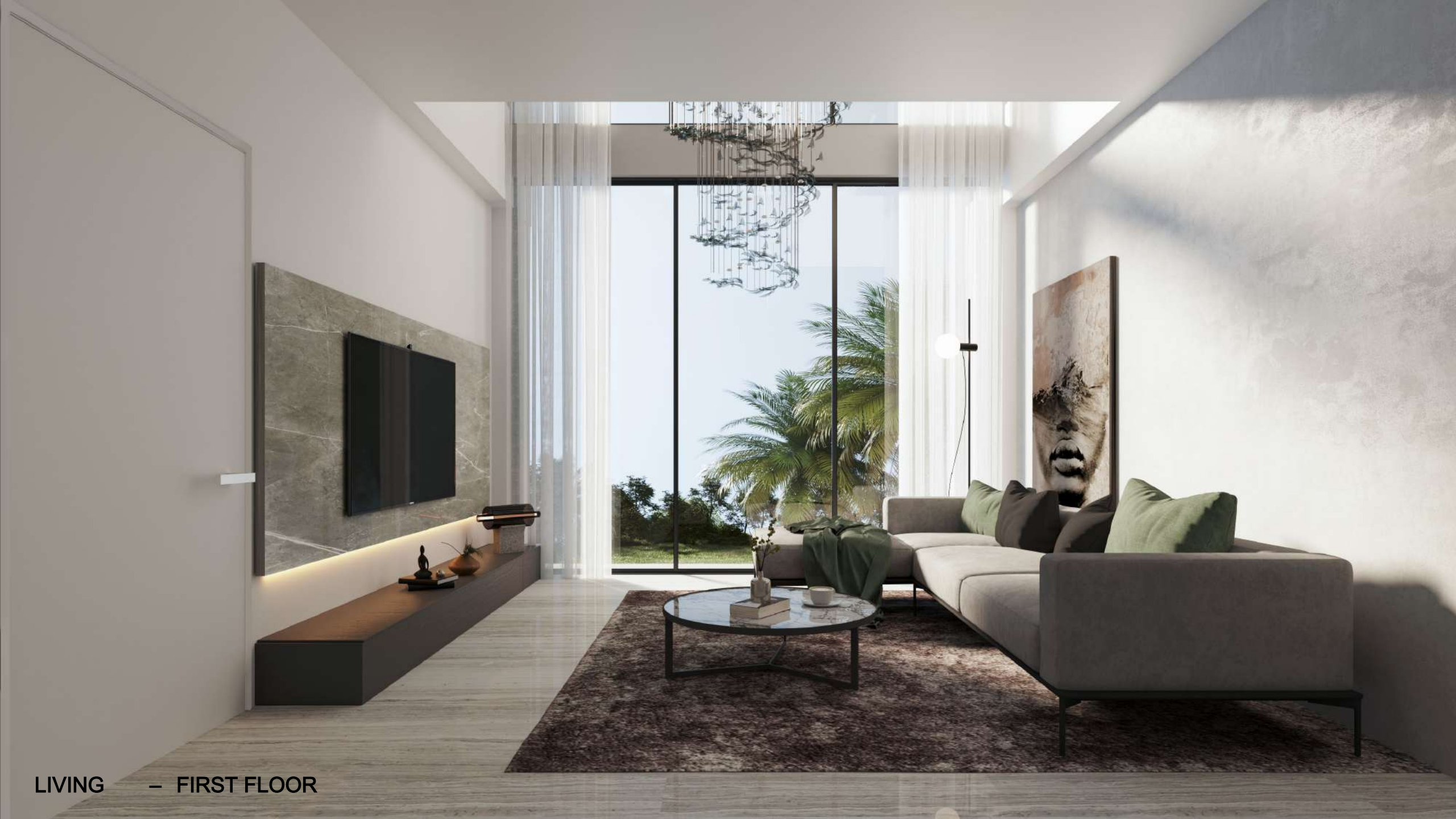
LIVING – FIRST FLOOR