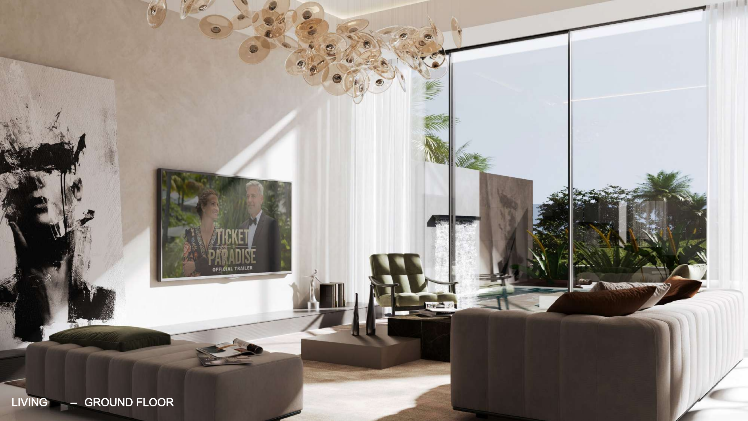
LIVING — GROUND FLOOR