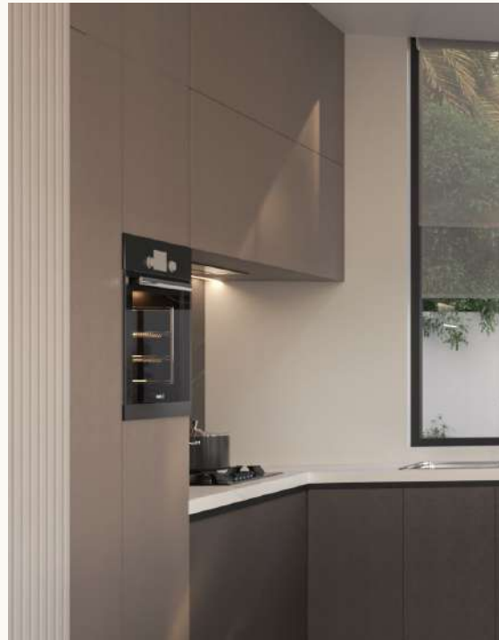
Modular kitchen with integrated appliances