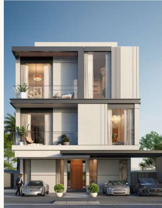
Wide parking spaces