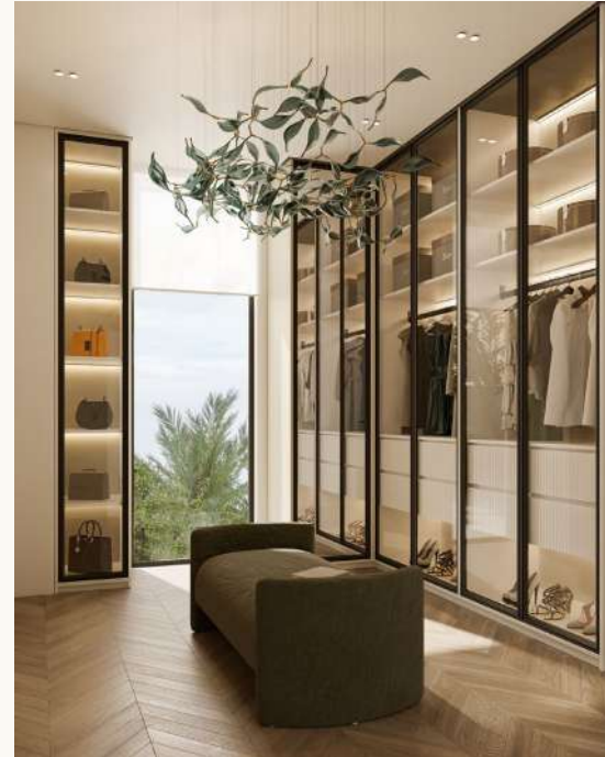
Thoughtfully spaced walk -in wardrobes