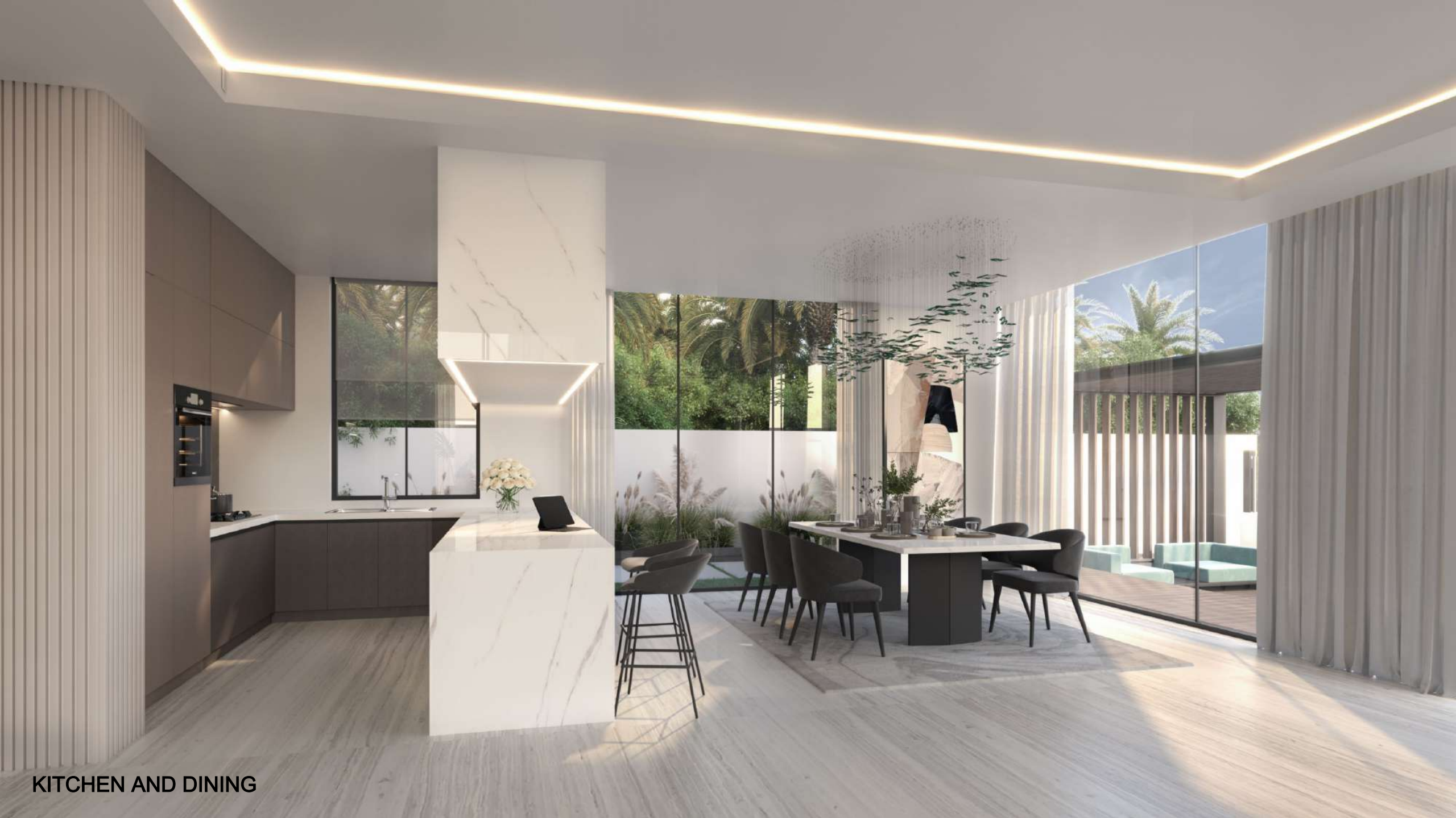
KITCHEN AND DINING