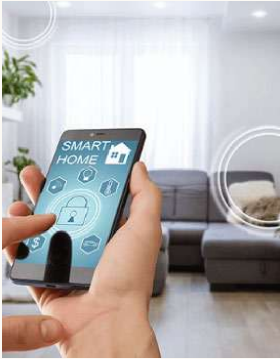
Sustainable and innovative home automation