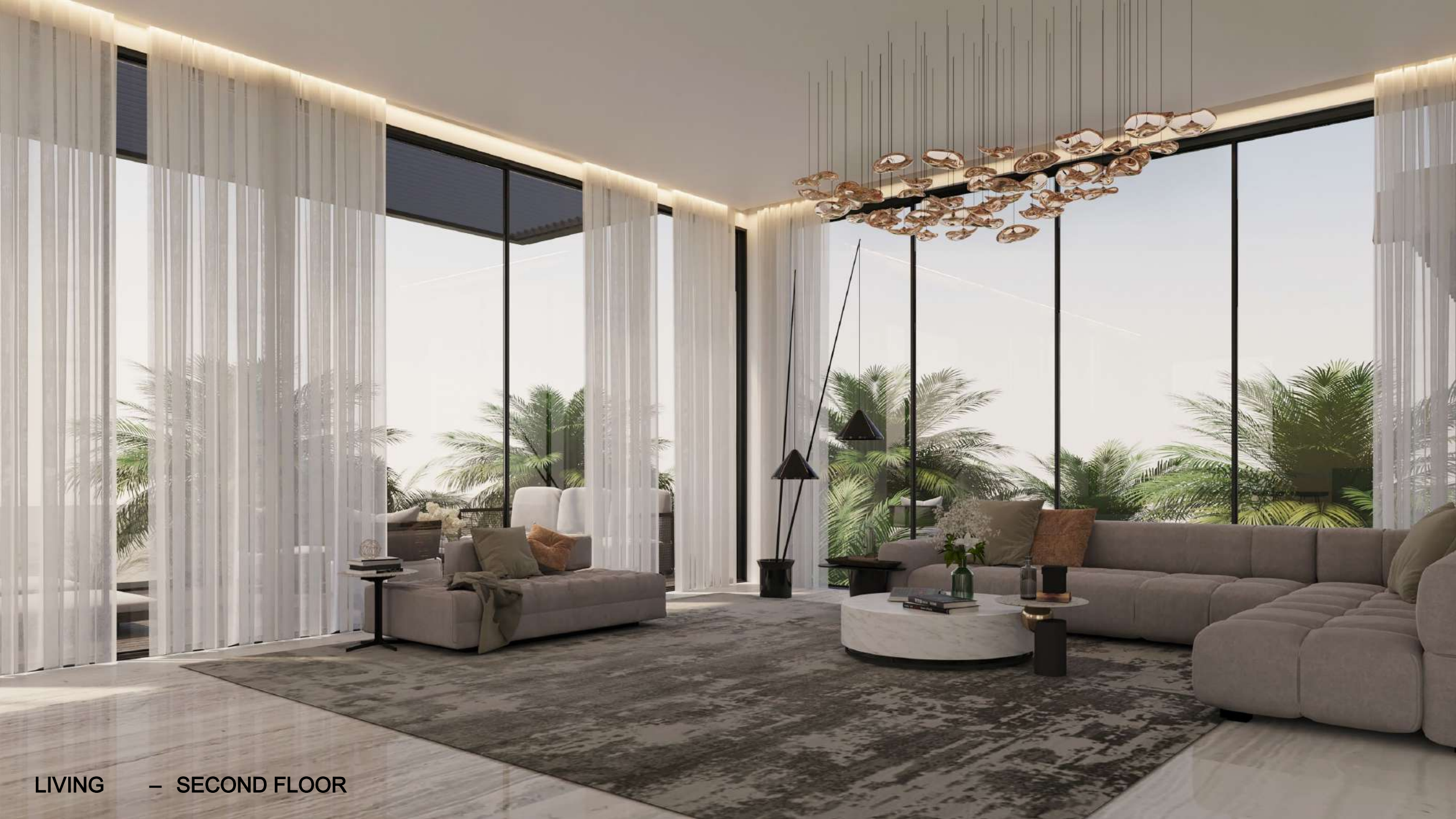
LIVING – SECOND FLOOR