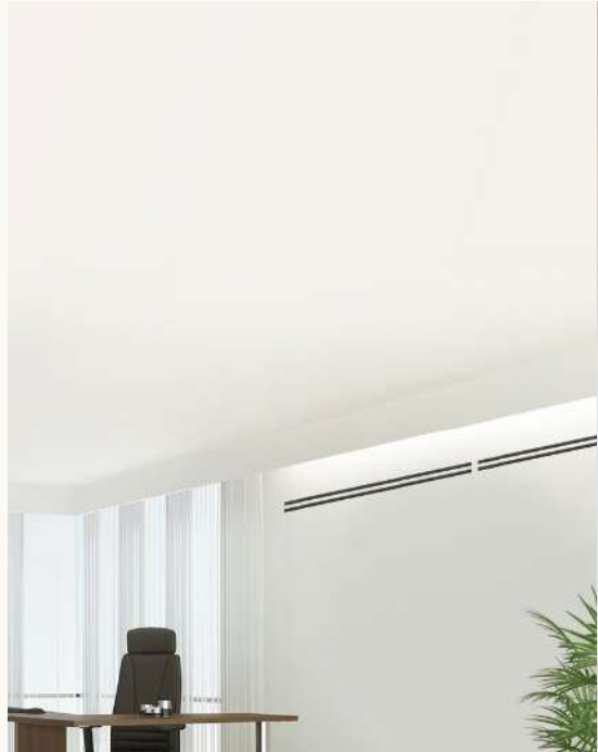
Variable Refrigerant Flow Air Conditioning System