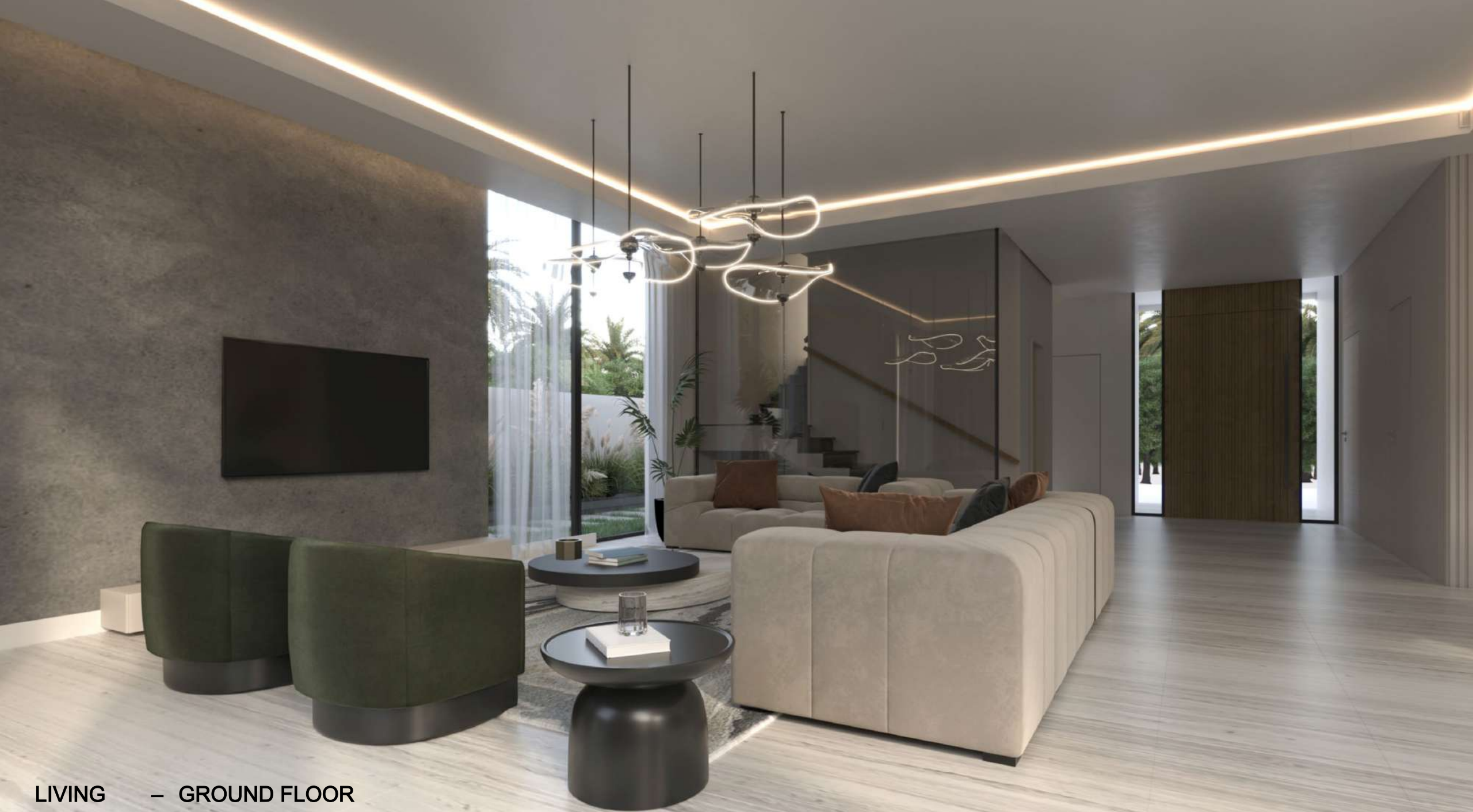
LIVING – GROUND FLOOR