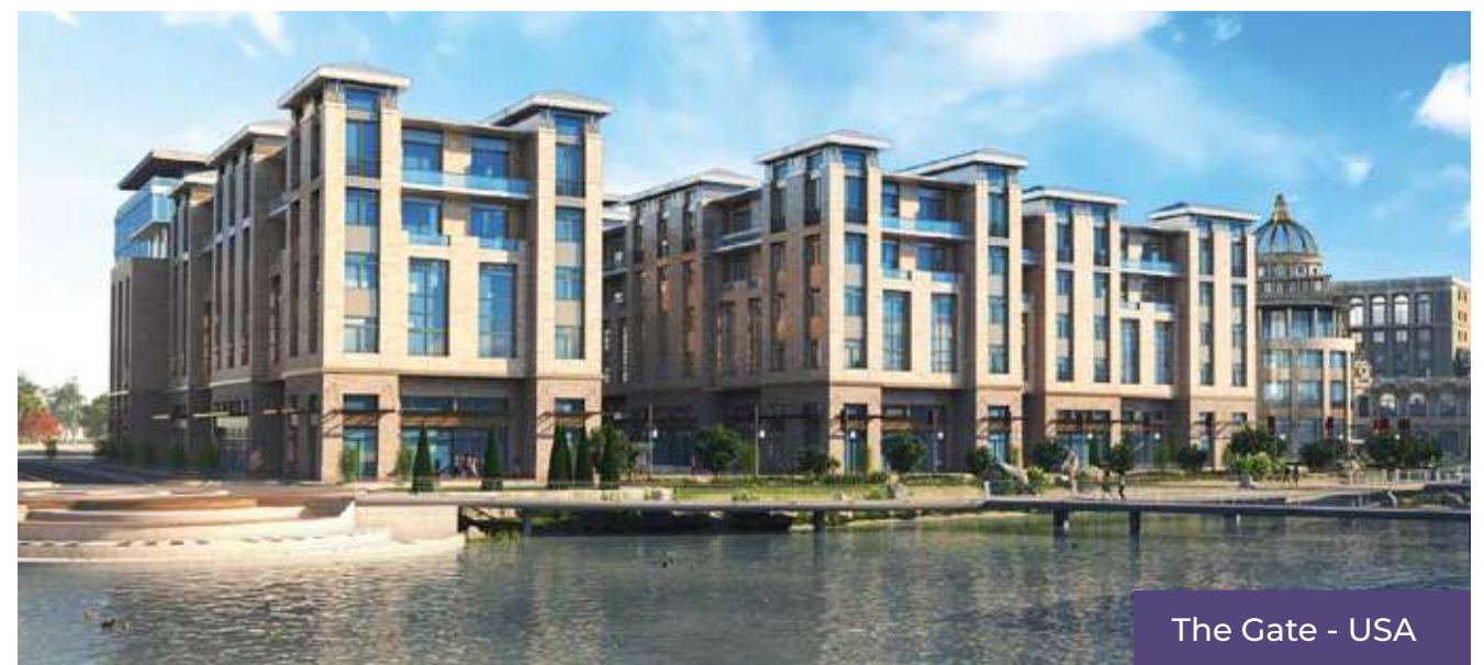
The Gate - USA

Today, an expanded and impressive portfolio of premium properties, which includes some of the most sought-after properties by meticulous clients worldwide, serve as a testament to IGO's well-deserved reputation as one of the top regional investment companies.