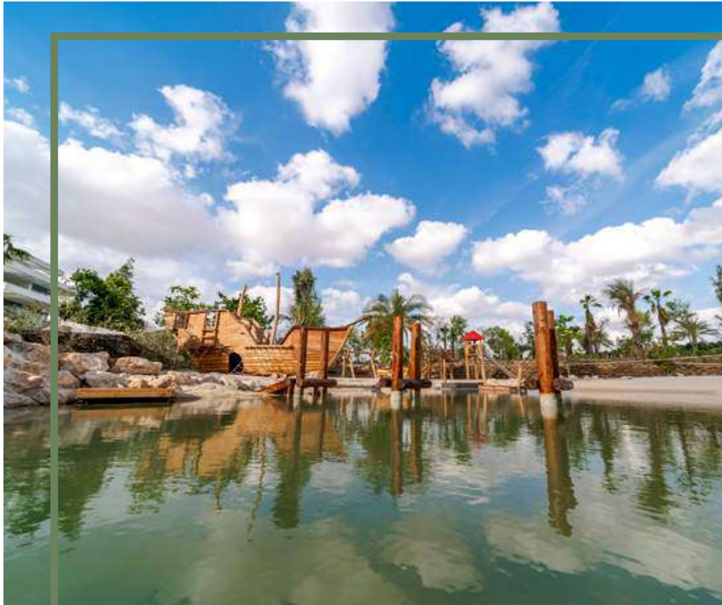
This bespoke pirate ship has been handcrafted from oak with pulley systems on board that allow children to interact and work in teams

Thoughtful design fused with materials sourced with love