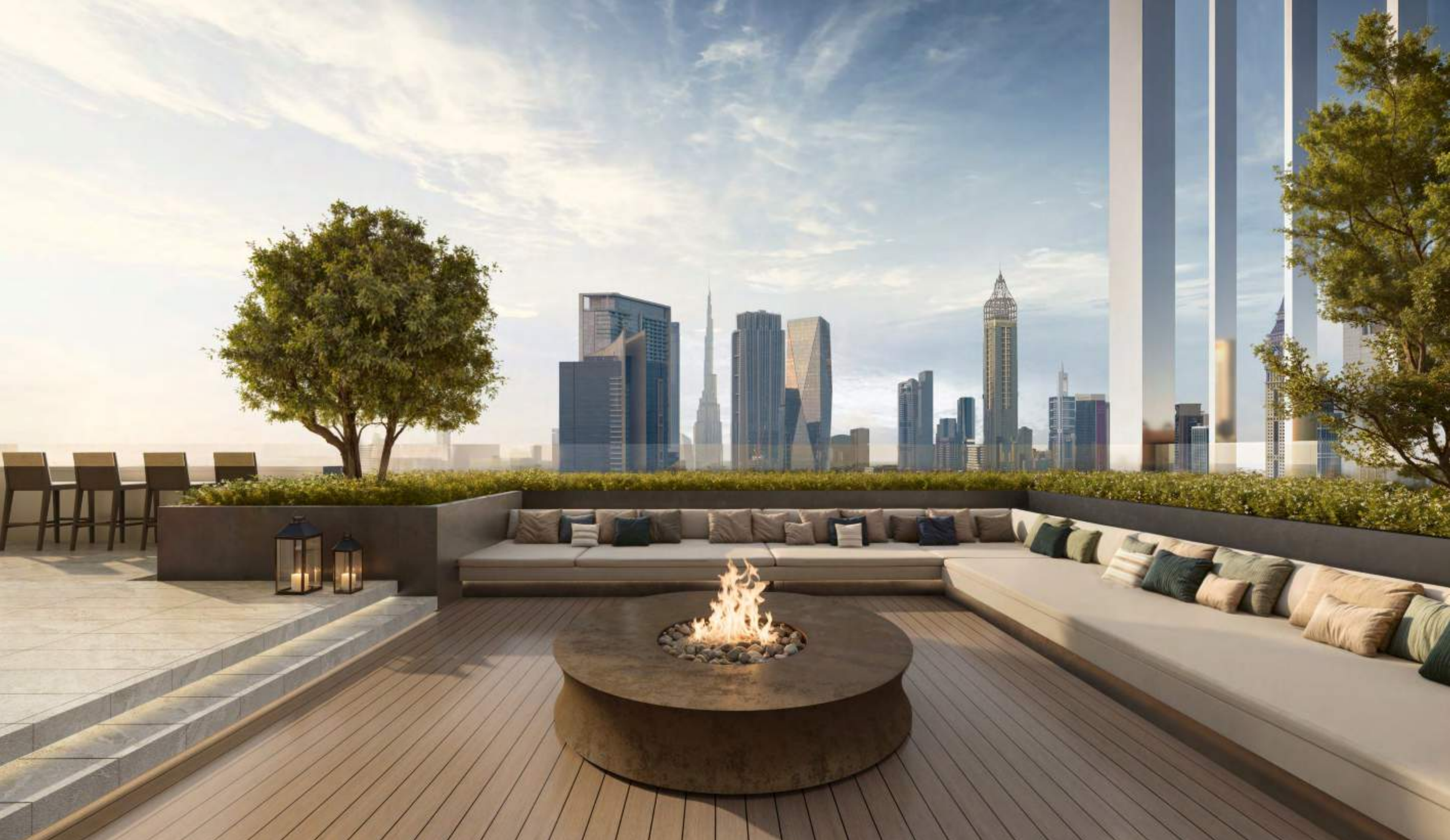
SKY TERRACE LOUNGE AREA