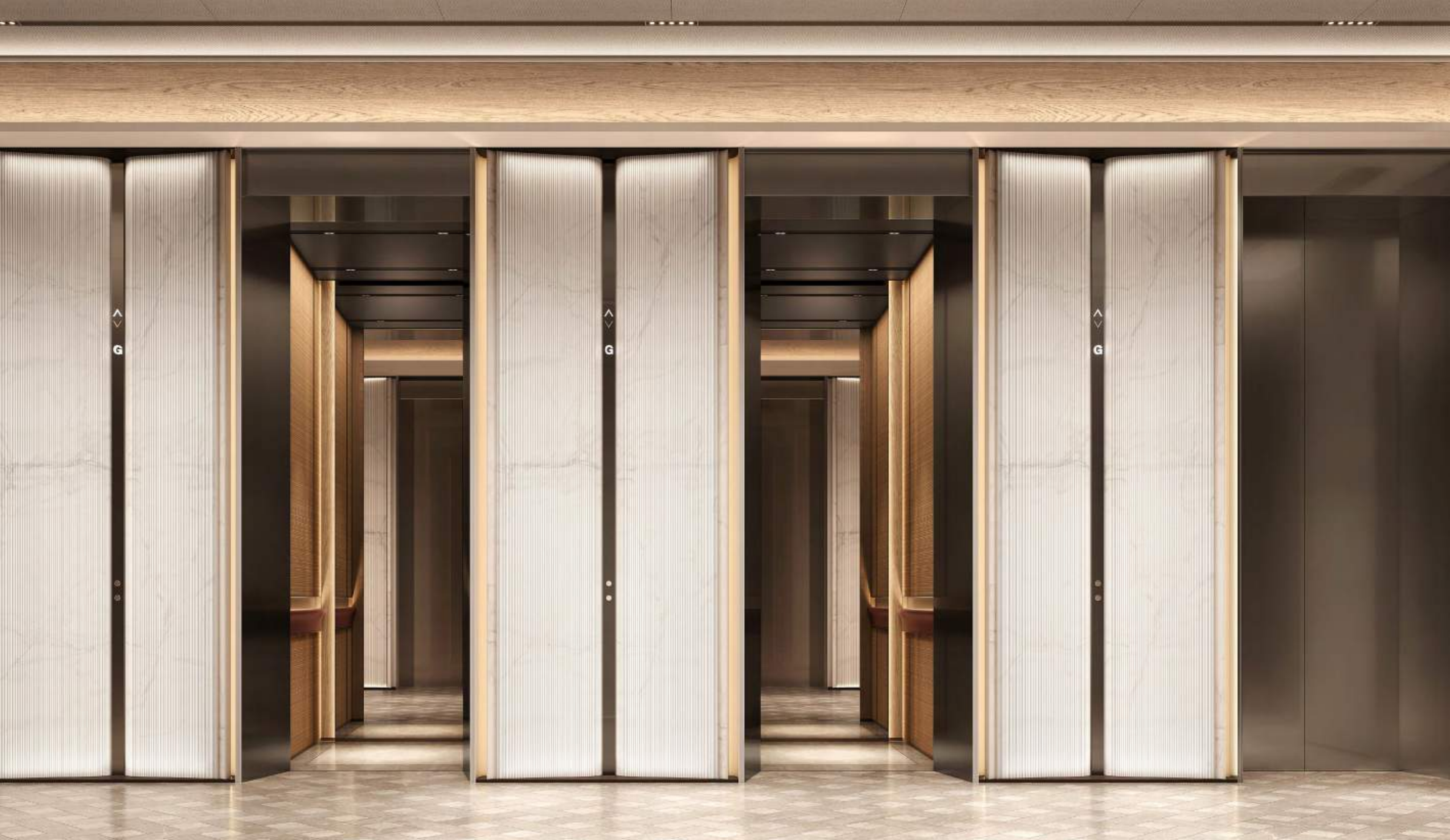
GROUND FLOOR LIFT LOBBY