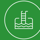
Infinity Swimming Pool

Meticulous attention to detail has been paid to every aspect of the building to make it the most desirable and convenient place to stay either short-term or long-term.