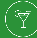
Cafe & Juice Bar