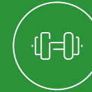
State-of- the-art Gym