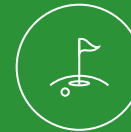
Open-Air Golf Simulator