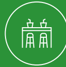
Restaurants & Cafe