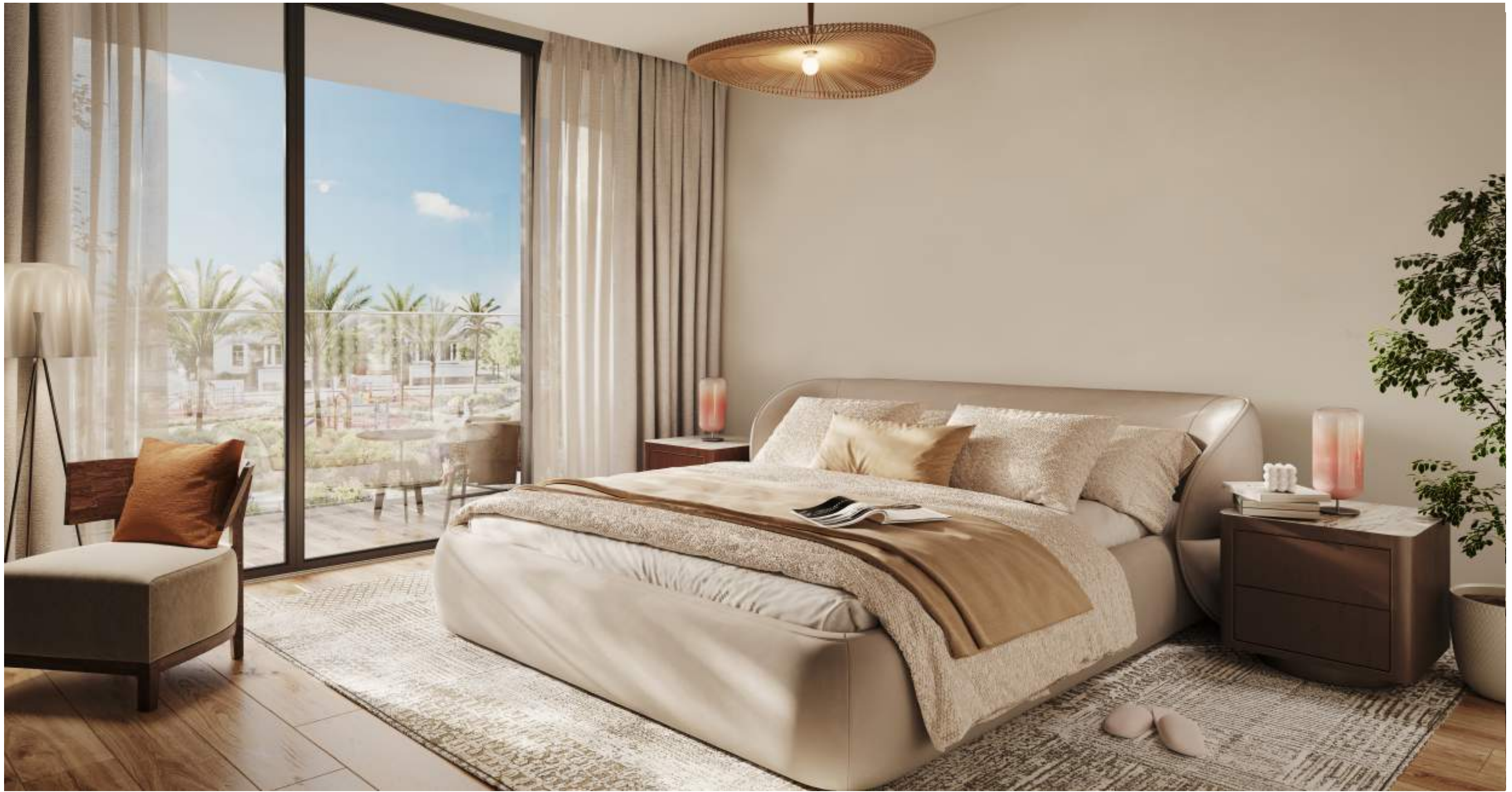
ARTIST RENDERING FOR ILLUSTRATIVE PURPOSES ONLY.