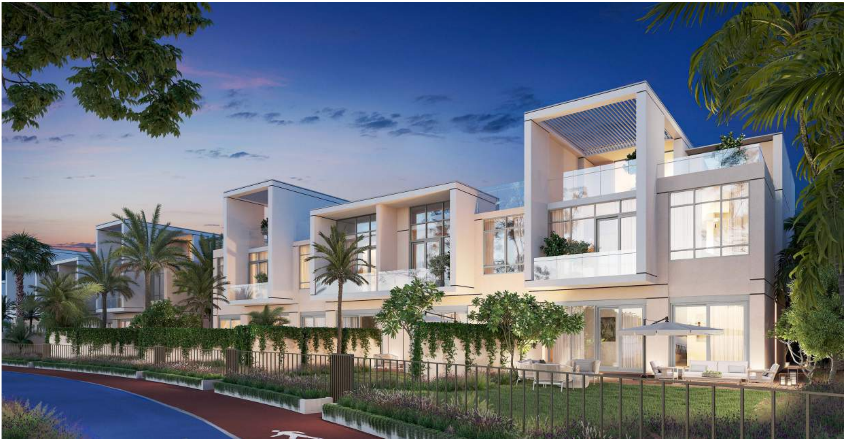
ARTIST RENDERING FOR ILLUSTRATIVE PURPOSES ONLY.