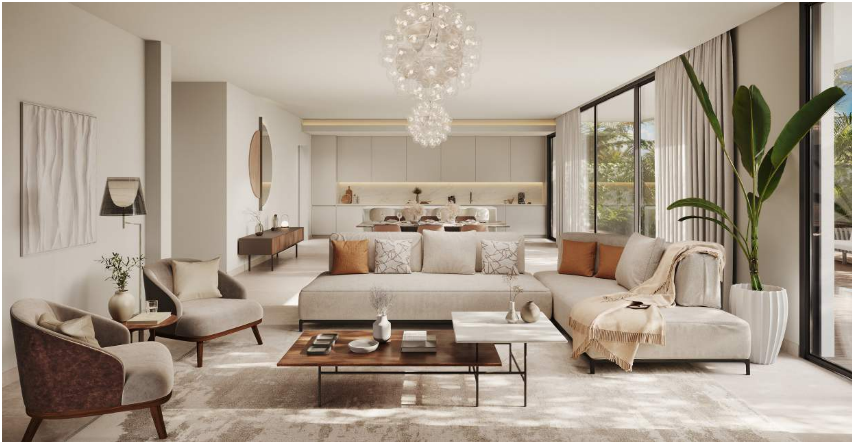
ARTIST RENDERING FOR ILLUSTRATIVE PURPOSES ONLY.