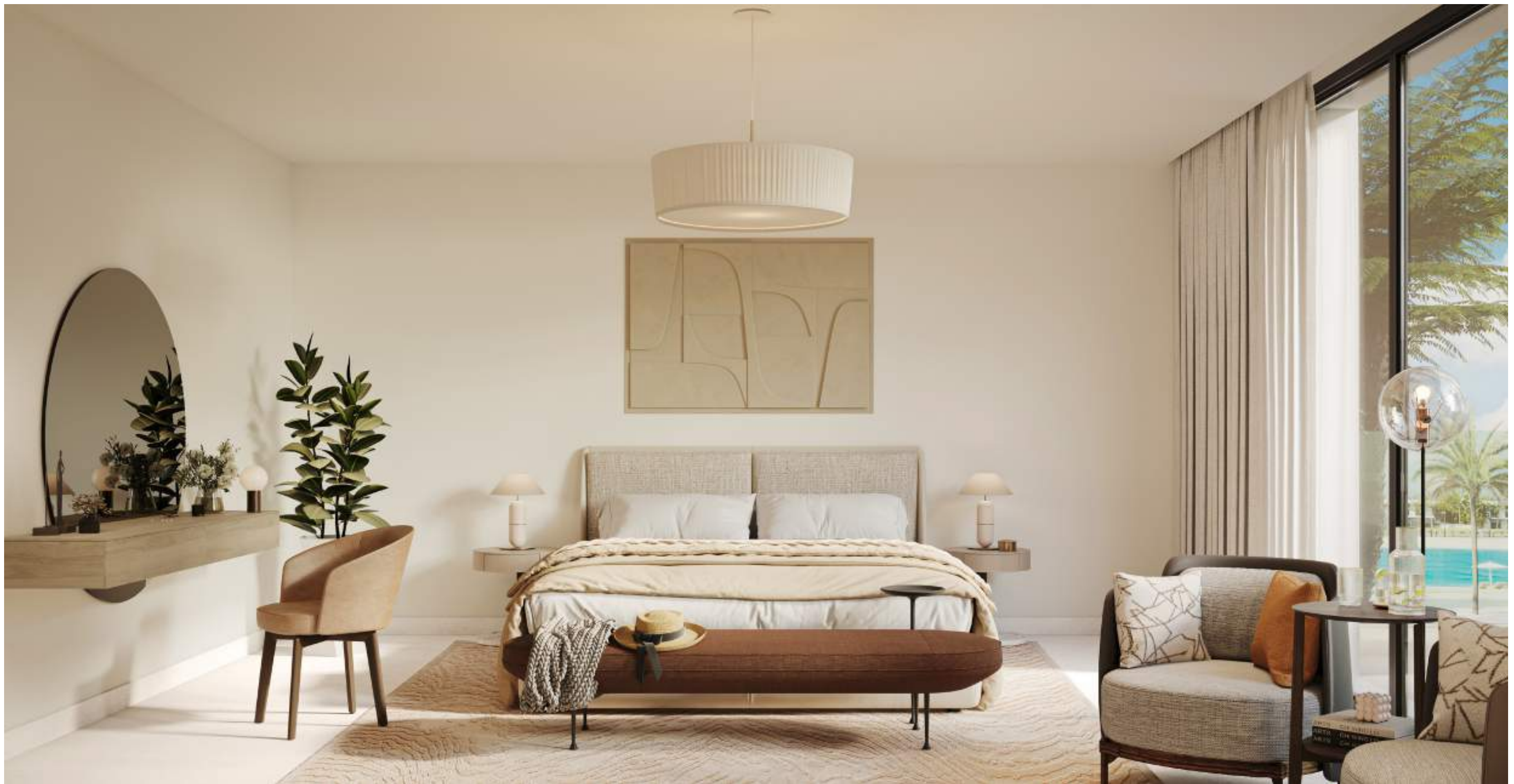
ARTIST RENDERING FOR ILLUSTRATIVE PURPOSES ONLY.