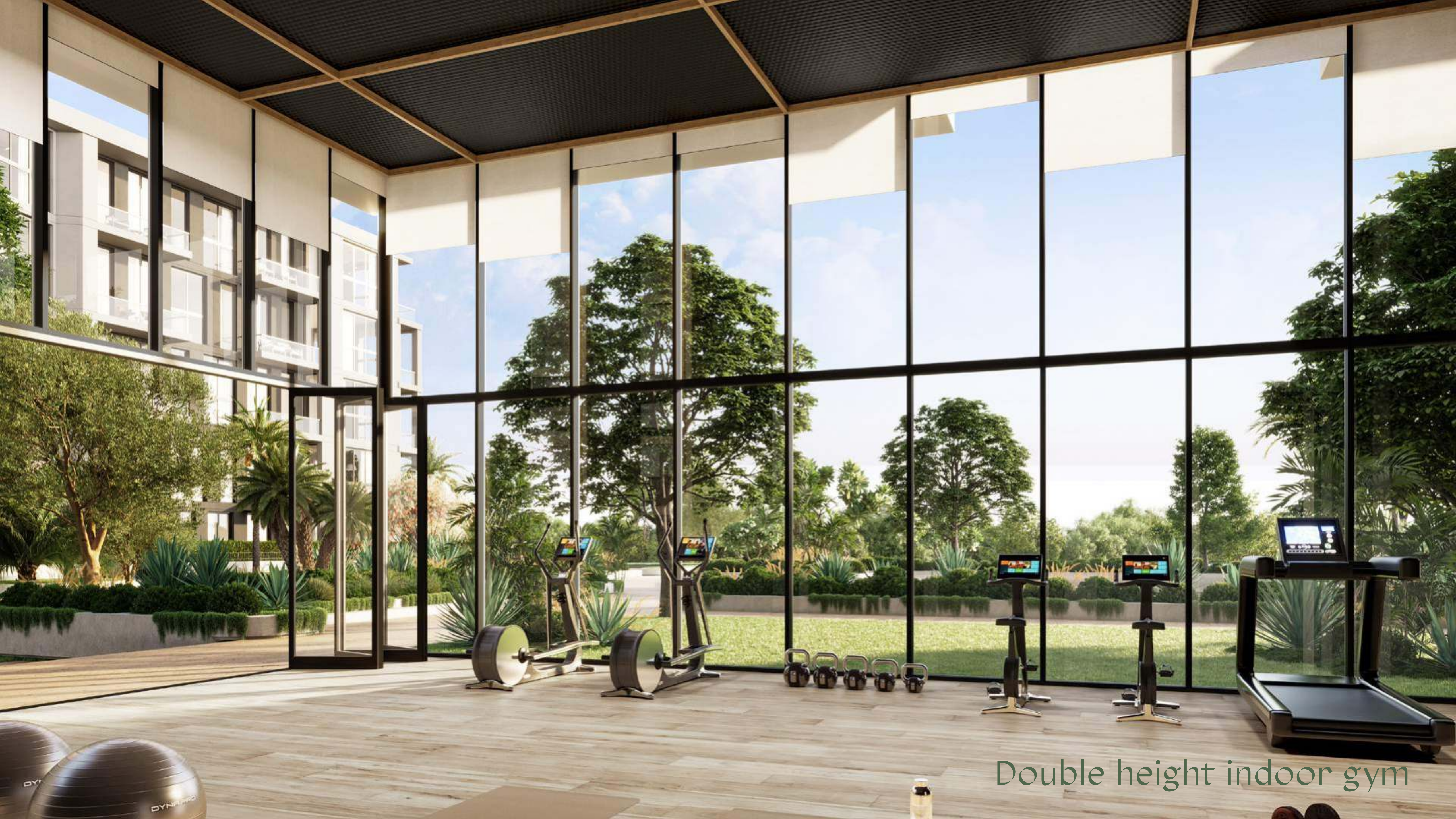
Double height indoor gym