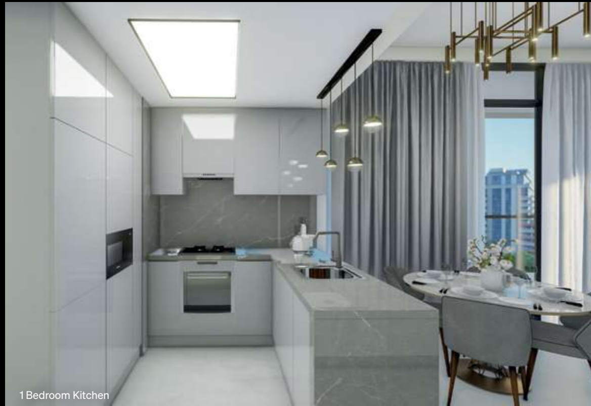
1 Bedroom Kitchen