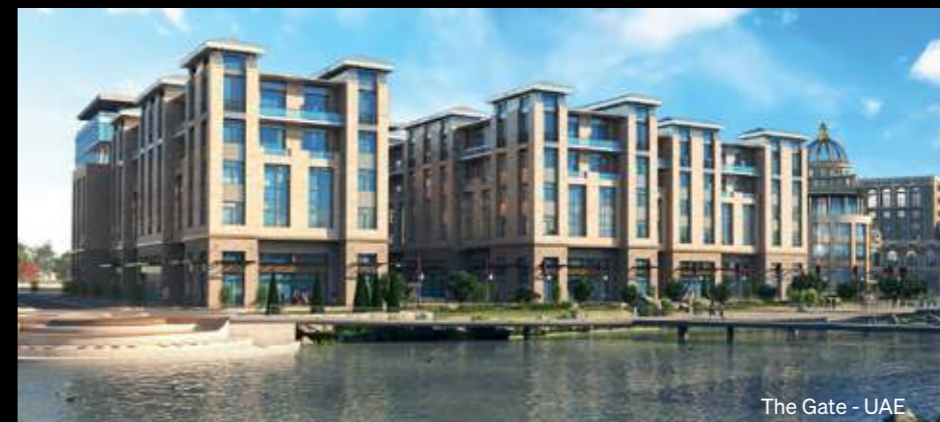
The Gate - UAE

Today, an expanded and impressive portfolio of premium properties, which includes some of the most sought-after properties by meticulous clients worldwide, serve as a testament to IGO's well-deserved reputation as one of the top regional investment companies.