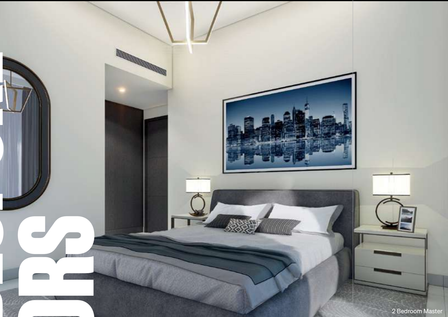
2 Bedroom Master

The Paragon apartments succeed in fusing an upmarket and stylish design with a harmonized and balanced atmosphere. Porcelain-tiled floors flow smoothly throughout each home, while European light fixtures are fitted within every room. Double glazed, floor to ceiling windows work functionally to keep out noise and heat, but also aesthetically to create a bright and open living space. The neutral color palette adds a touch of understated elegance or acts as the perfect base for owners to decorate to their own liking.