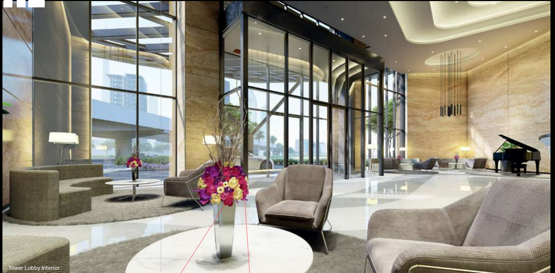
Tower Lobby Interior

THE PARAGON HAS AN EDGY URBAN ARCHITECTURAL DESIGN AND IS BUILT WITH THE HIGHEST QUALITY MATERIALS AND FINISHES, MAKING IT THE DEFINITION OF ULTIMATE SOPHISTICATION.