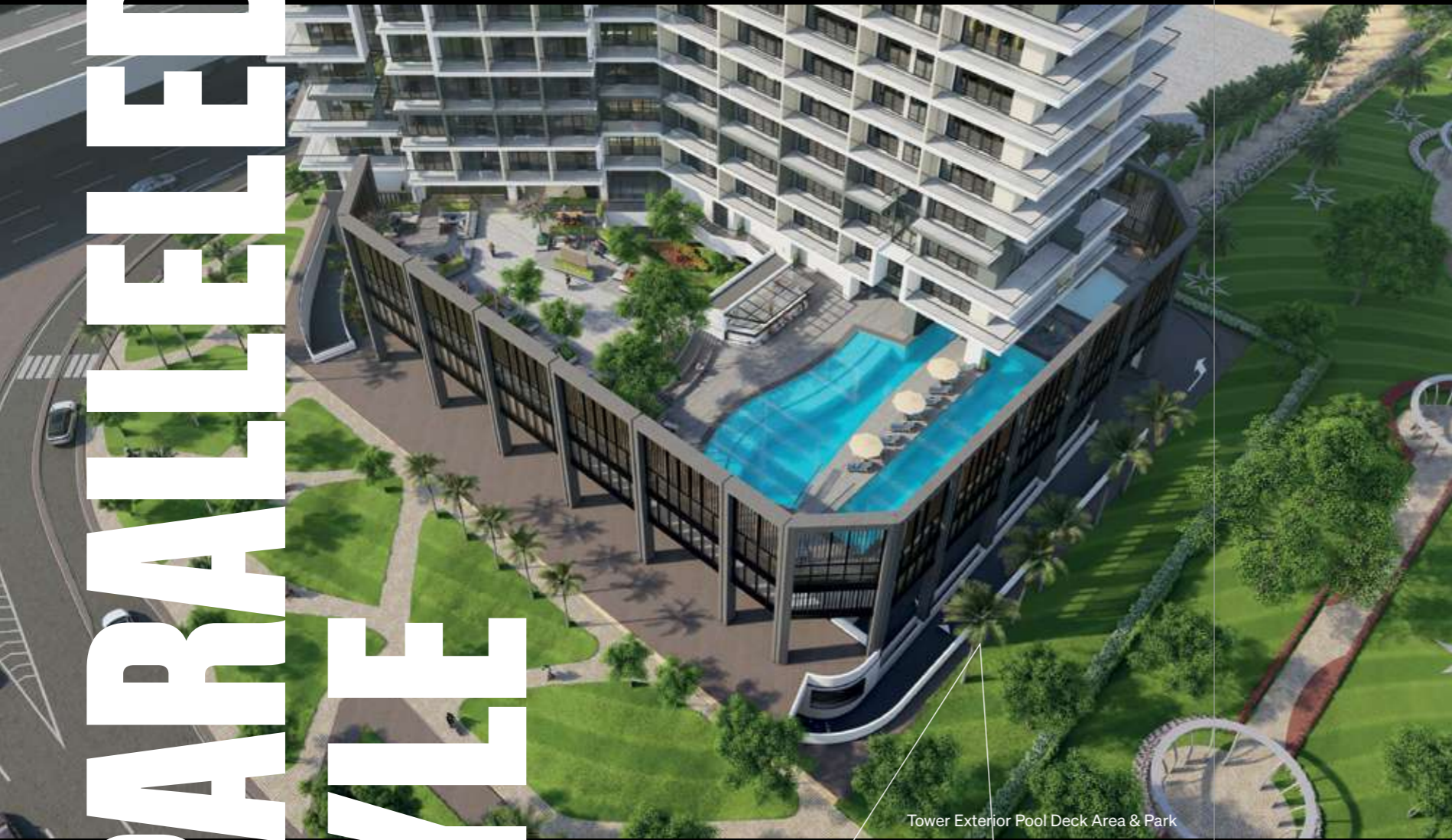
Tower Exterior Pool Deck Area & Park