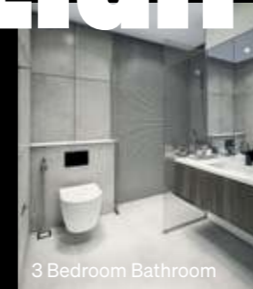
3 Bedroom Bathroom