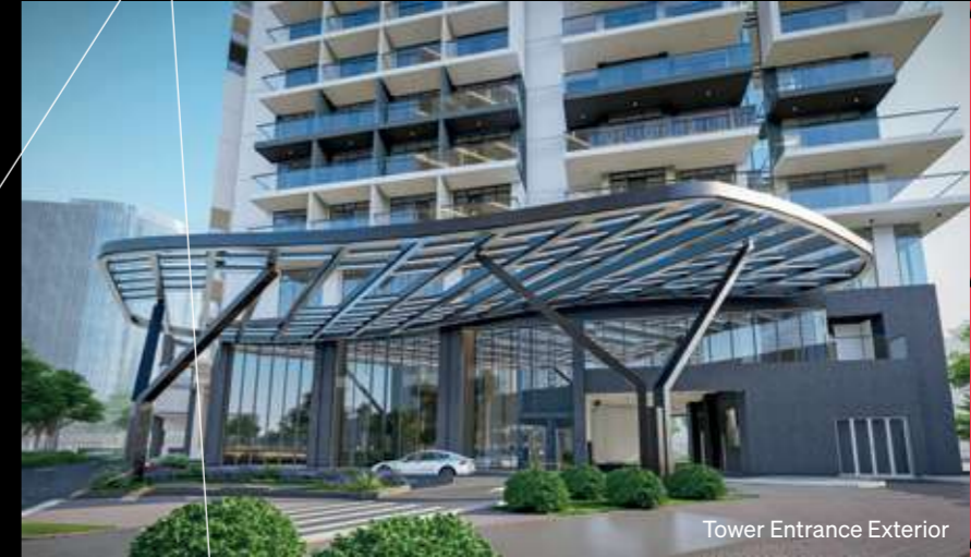
Tower Entrance Exterior