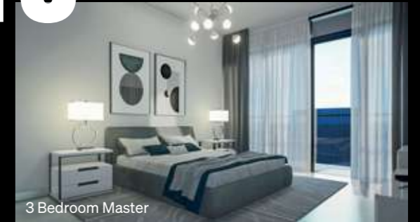
3 Bedroom Master