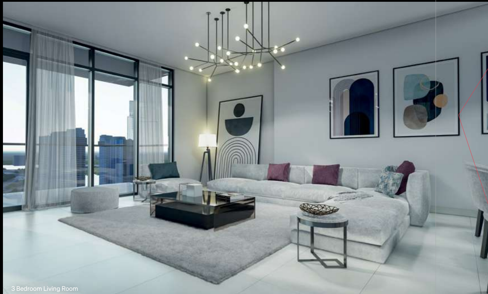
3 Bedroom Living Room