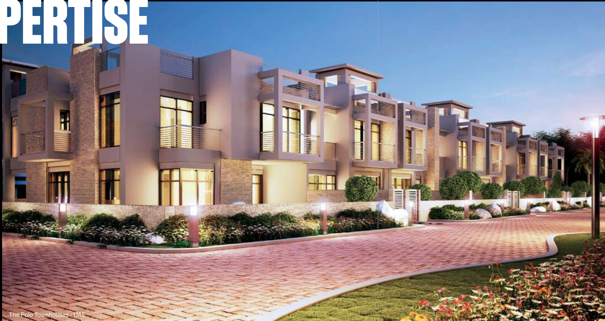
The Polo Townhouses - UAE