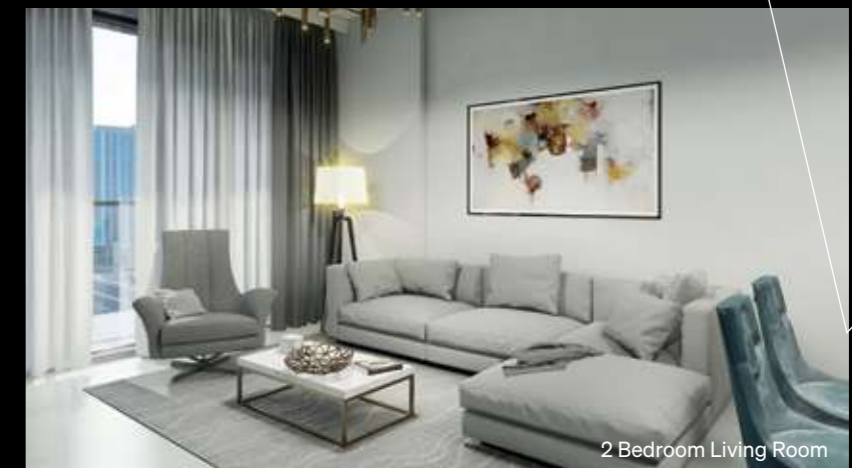
2 Bedroom Living Room