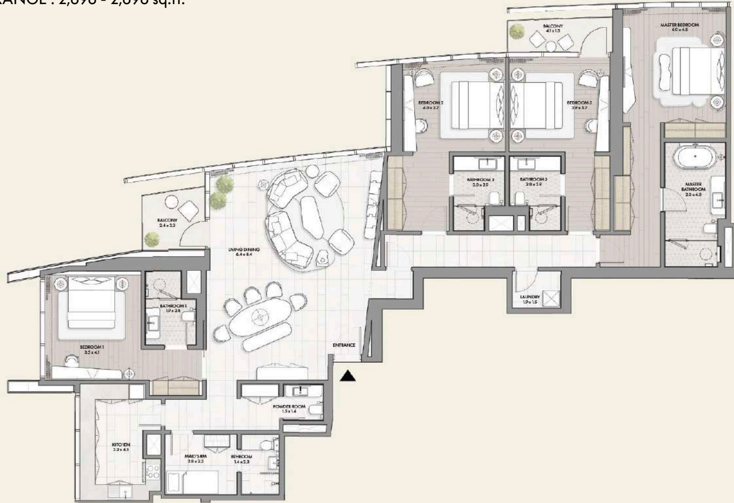
LEVEL 21 - 32