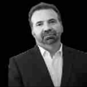
Head - PNC Architects Sobha Group