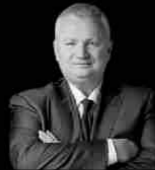
Design Director Corporate Sobha Group