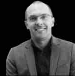
Head - Quality & Technology Sobha Group

A seasoned professional in the field of architecture, engineering and construction (AEC) with more than 27 years of work experience possessing a Master Craftsman in Civil construction and a BA in Architecture education from Germany. In his current stint with Sobha Group, he oversees and engages in project design and implementation using an independent technical inspection regime from developers side which is spearheaded by German Master Craftsmen ensuring European/German Quality utilizing internationally renowned construction productivity software.