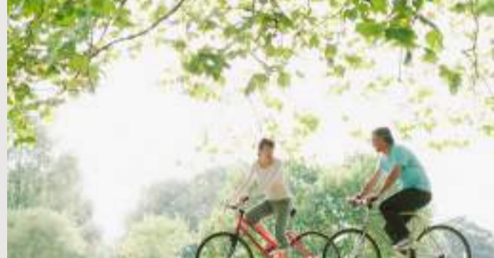
Jogging & Cycling Tracks