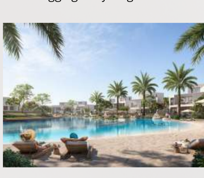
Beach at your Doorstep