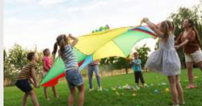
Community Parks & Playgrounds