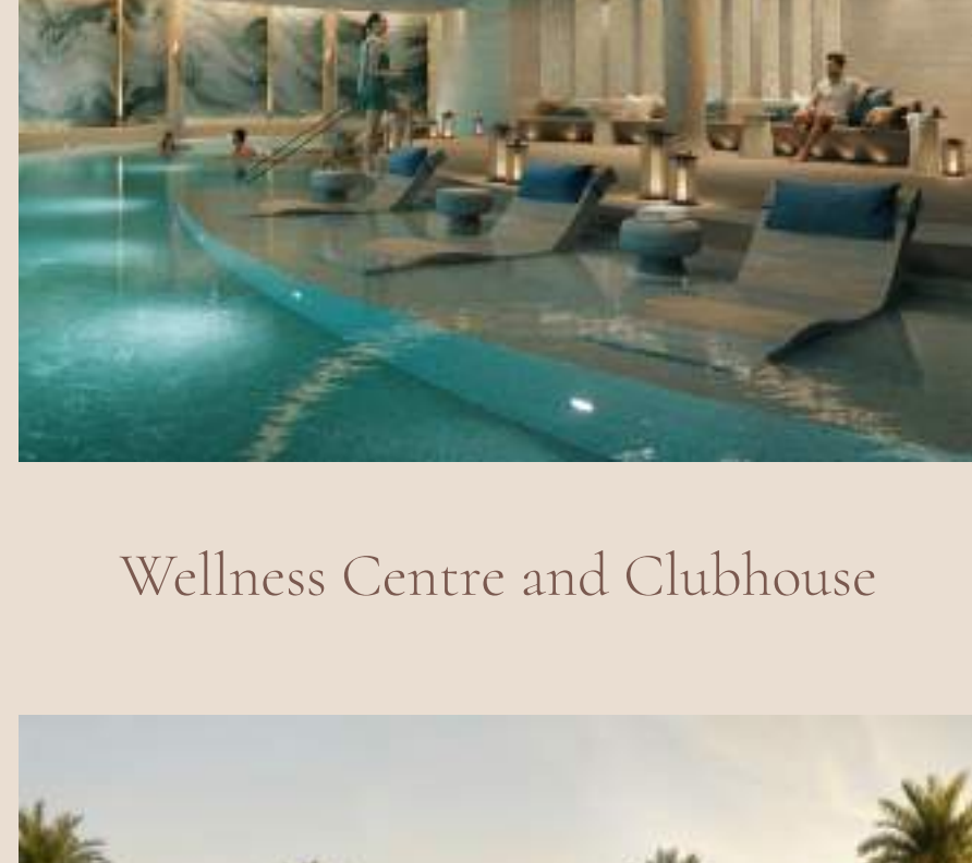
Wellness Centre and Clubhouse